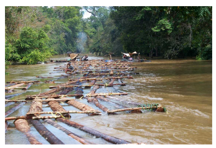
Timber raft from community-based logging suspiciously to be illegal, found in a creek of Mahakam River on the way back to Samarinda. April 2002

MFP, has led communities improving their skills and living standards supported view interviews with NGOs and civil society. The PPA in Gading Kembar, a village in Java, for instance, has led to people devising strategies to give their families and the poorest community members' better access to forest and land resources. This has resulted in people acquiring new skills as well strengthening