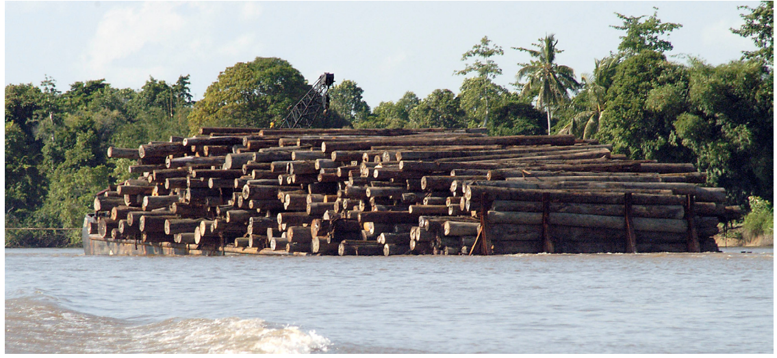
Timber transportation found on the way to West Kutai, East Kalimantan. May 2003

4.23 MFP can also claim to have had an impact on people's livelihoods . Reform of forestry policy at the local level has provided access to forest resources and state land, helped resolve multi-dimensional conflicts and enforce forest resources governance. As 'Aid That Works' states: "New regulations have helped to provide villagers with access to state land, and done much to reduce conflict and enable local people to improve their livelihoods". In one example, dozens of families in a village are now able to grow profitable tree crops on state land. This has enabled them to significantly increase their incomes and improve the management of the hillsides. In another example in Kendari, many families now earn enough money to send their children to school and pay for medical care when they are sick – something that was not previously affordable. In general, villagers are now working with forest officers rather than struggling against them.