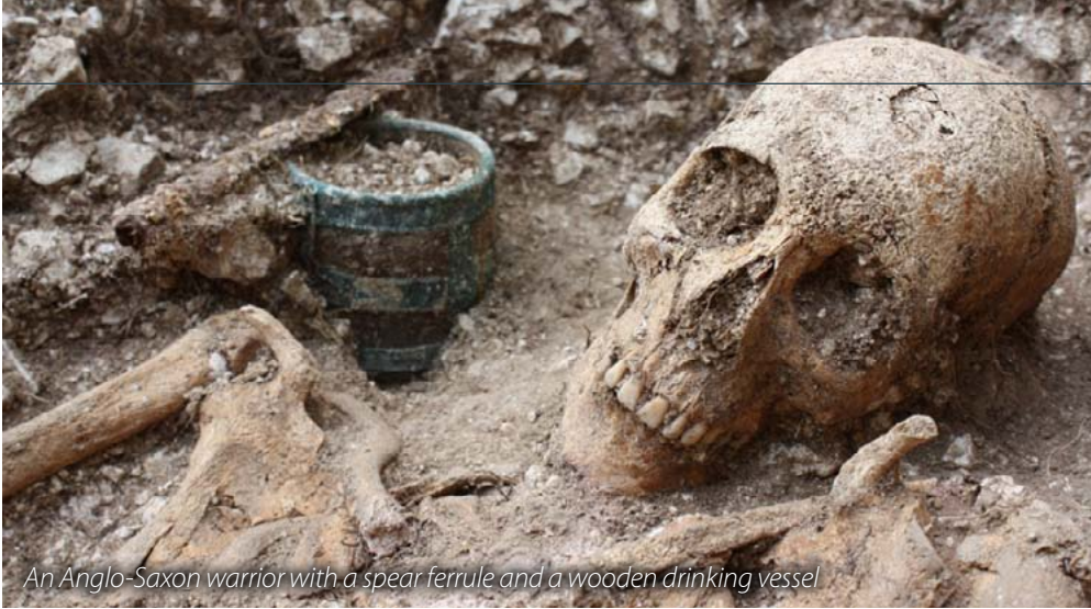
An Anglo-Saxon warrior with a spear ferrule and a wooden drinking vessel

During the eight-week dig the team have discovered three shield bosses, a square headed broach, three disc broaches, two gilded button broaches, a Roman broach, hundreds of amber and glass beads, a silver ring, five spear heads, a spear ferrule and a wooden drinking vessel with bronze bands.