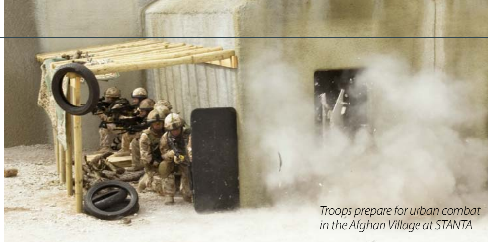
Troops prepare for urban combat in the Afghan Village at STANTA

“Operations are increasingly conducted among the population,” he says.