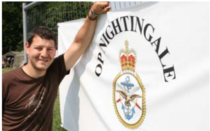
Soldiers unearth Salisbury Plain secrets