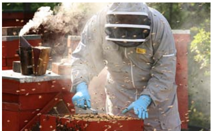
Win a jar of DIO honey