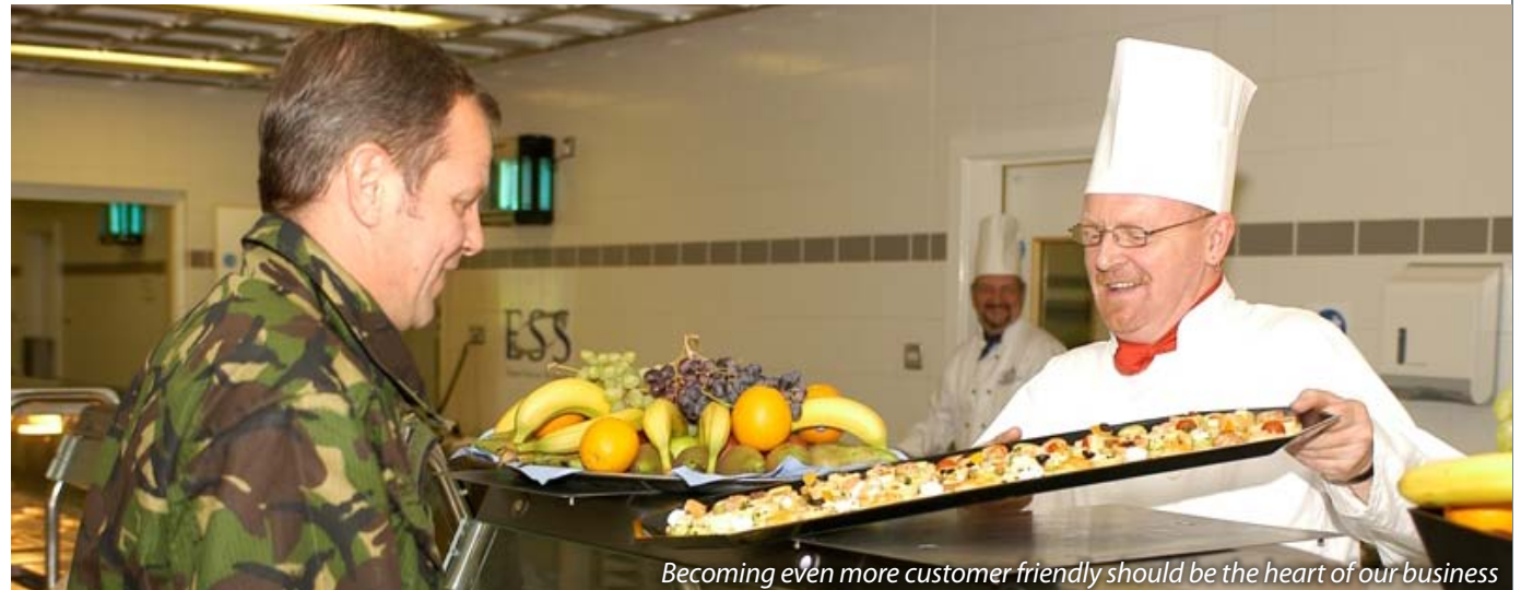
Becoming even more customer friendly should be the heart of our business

Having a collective Ops focus is good for the customer – I think Ops staff would also benefit in career terms through pro-active exploitation of the whole Ops field in personal development and employment terms. How are you going to progress your career if you focus your efforts on one small area of the business?