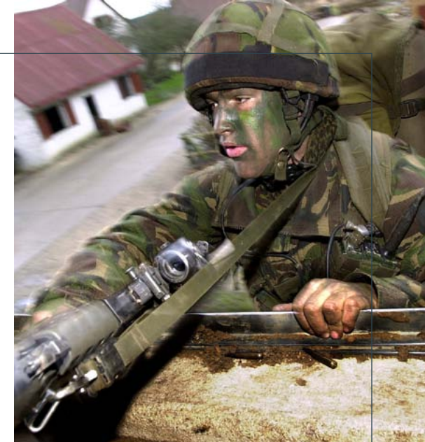
A modern soldier clambers through a window during a training exercise at STANTA

He says: "The population of the villages were drawn together at two locations – the Blacksmith's Forge at Tottington and at West Tofts School – and they were told to leave within three weeks.