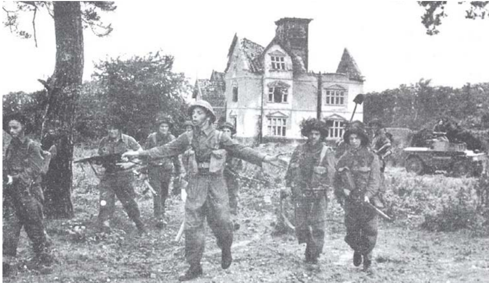
An officer leads his men in a training exercise at STANTA in the early 1950s