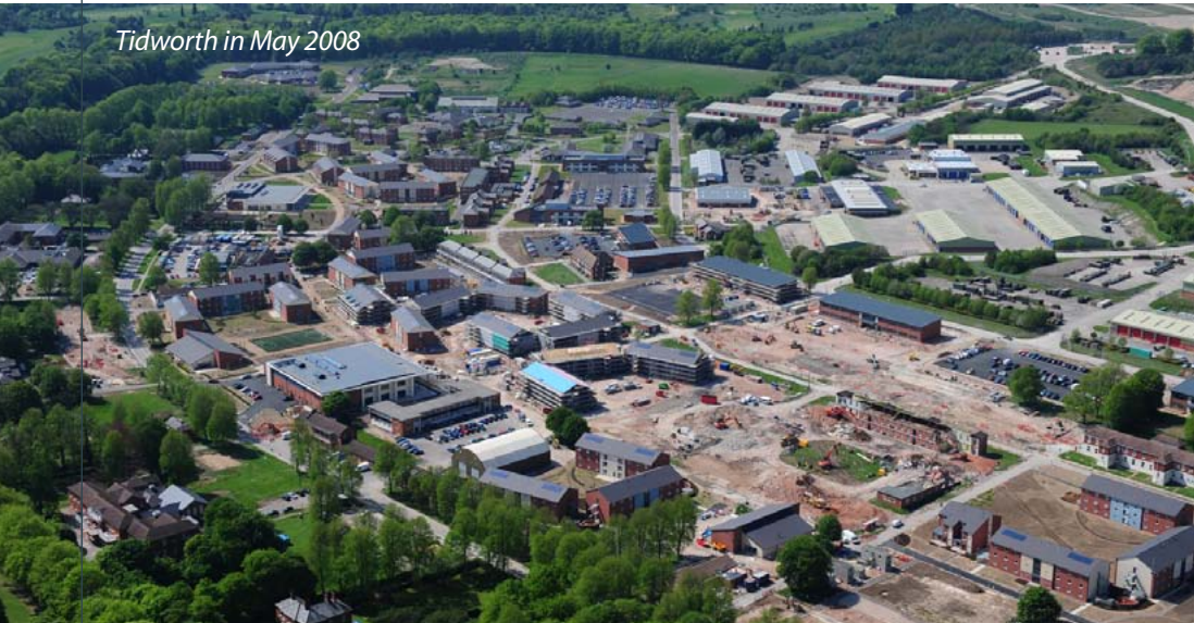
Tidworth in May 2008

These pictures show how a £1.5 billion DIO project to improve living accommodation for 18,700 soldiers is gathering pace.