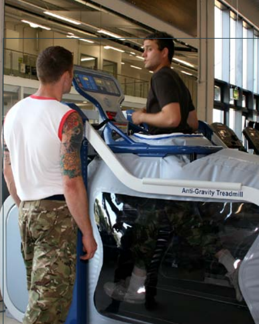
A recruit uses one of Parker Hall's anti-gravity treadmills. This equipment controls air pressure in a chamber to gently lift the user and reduce the impact of running on the feet and legs