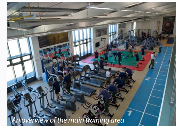
An overview of the main training area

colleagues have been completely committed throughout the planning and delivery and I think that is because we all realise that the facility is for such a great cause, we are delivering something that really matters." ➤