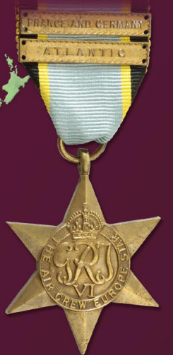
Air Crew Europe Star