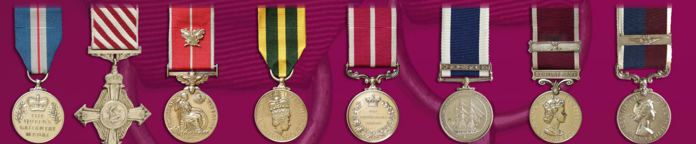
Queen's Gallantry Medal Air Force Cross British Empire Medal (For Gallantry) Queen's Volunteer Reserves Medal Meritorious Service Medal Long Service & Good Conduct Medal (Navy) Long Service & Good Conduct Medal (Army) Long Service & Good Conduct Medal (Royal Air Force)