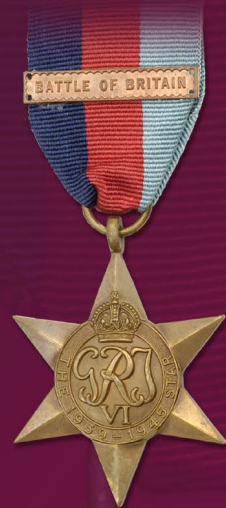
1939 - 1945 Star