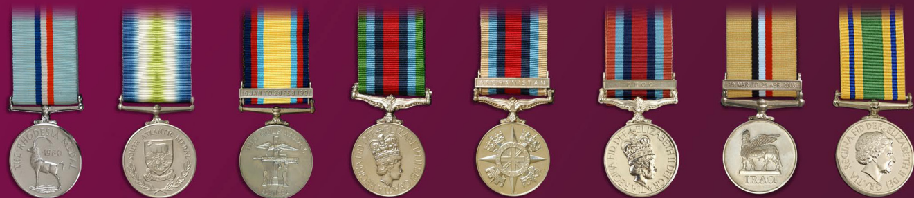
Rhodesia Medal South Atlantic Medal Gulf Medal Operational Service Medal Sierra Leone Operational Service Medal Afghanistan Operational Service Medal Democratic Republic of Congo Iraq Medal Iraq Reconstruction Service Medal