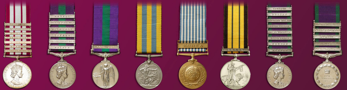
Naval General Service Medal 1915 - 1962 General Service Medal 1918 - 1962 General Service Medal 1918 - 1962 (Canal Zone) Korea Medal Korea United Nations Medal General Service Medal Africa 1952 - 1956 (Kenya) General Service Medal 1962 - General Service Medal 1962 -