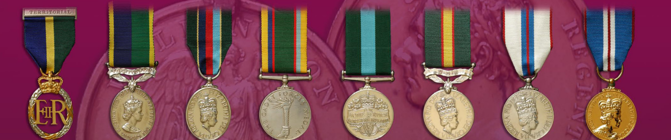
Efficiency Decoration (Territorial) Efficiency Medal (Territorial) Volunteer Reserves Service Medal Cadet Forces Medal Northern Ireland Home Service Medal Ulster Defence Regiment Medal Queen's Silver Jubilee Medal Queen's Golden Jubilee Medal