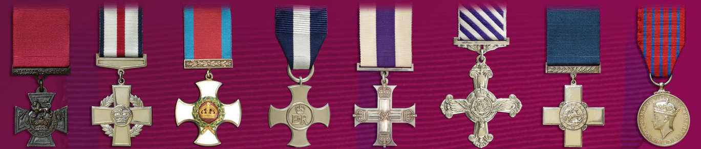
Victoria Cross Conspicuous Gallantry Cross Distinguished Service Order Distinguished Service Cross Military Cross Distinguished Flying Cross George Cross George Medal