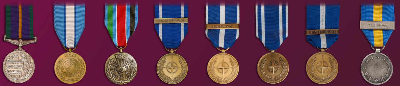
Accumulated Campaign Service Medal United Nations Cyprus Medal United Nations Former Republic of Yugoslavia Medal NATO Former Republic of Yugoslavia Medal NATO Kosovo Medal NATO Macedonia Medal NATO Non Article 5 Medal European Security & Defence Policy Service Medal Op Althea