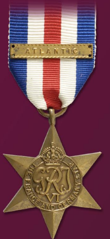
France & Germany Star