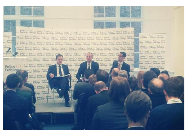
"Jump on the bandwagon and get yourself a neighbourhood plan"

Parish and town councils will receive the money directly. In areas without a parish council, the local authority must agree with the local community how to spend the money. Communities that do not have a neighbourhood plan will receive 15% of CIL receipts (subject to a cap). The Localism Act sets out what neighbourhood CIL can be spent on: the provision, improvement, replacement, operation or maintenance of infrastructure - or anything else that is