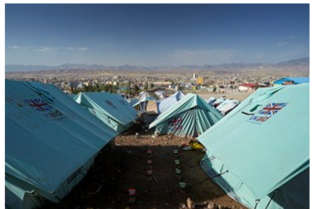
Tents for Iraqi refugees provided by UKaid