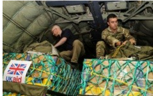
UK humanitarian supplies being delivered

A further 2 aid drops were carried out (30 th -31 st August) to deliver aid to thousands of people trapped by ISIL in the Iraqi town of Amerli. Total supplies dropped – 8.5 tonnes of water and nearly 3 tonnes of food – included; 420 containers carrying over 8,400 litres of clean drinking water; 210 packs of high energy biscuits; 70 ration packs; and 92 individual ration meals.