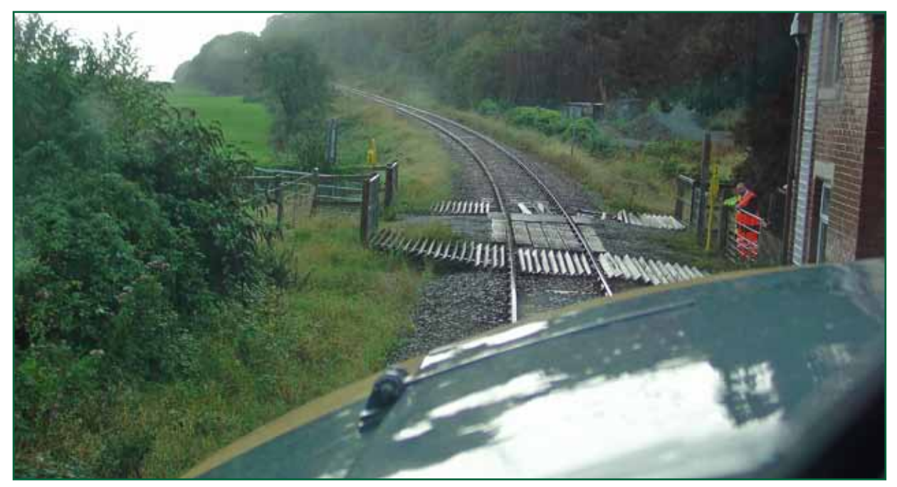
Figure 3: View of the crossing from the driving cab of the locomotive at a distance of approximately 10 m from the crossing