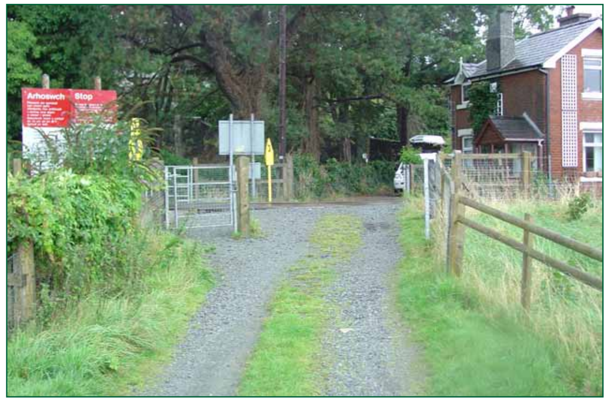
Figure 2: View of the crossing approaching from the south

6 The signage provided at each side of the crossing reads in both Welsh and English as follows: "Stop. Always telephone before crossing with vehicles or animals to find out if there is time to cross. Tell the crossing operator if the vehicle is large or slow moving. Open far gate before crossing with vehicles or animals, cross quickly, close and secure gates after use. Maximum penalty for not doing so £1000".