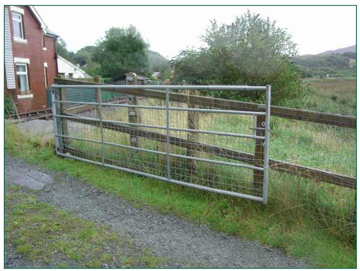
Figure 4: Restricted view from road on the south side of crossing in the direction of Penrhyndeudraeth station

16 From the position a car driver would normally have parked their car to open the gates, and from which they would then have driven onto the crossing, the visibility of the approaching locomotive would have been severely restricted by the same bush which restricted the train driver's view (paragraph 11). The restricted view is shown in figure 4.