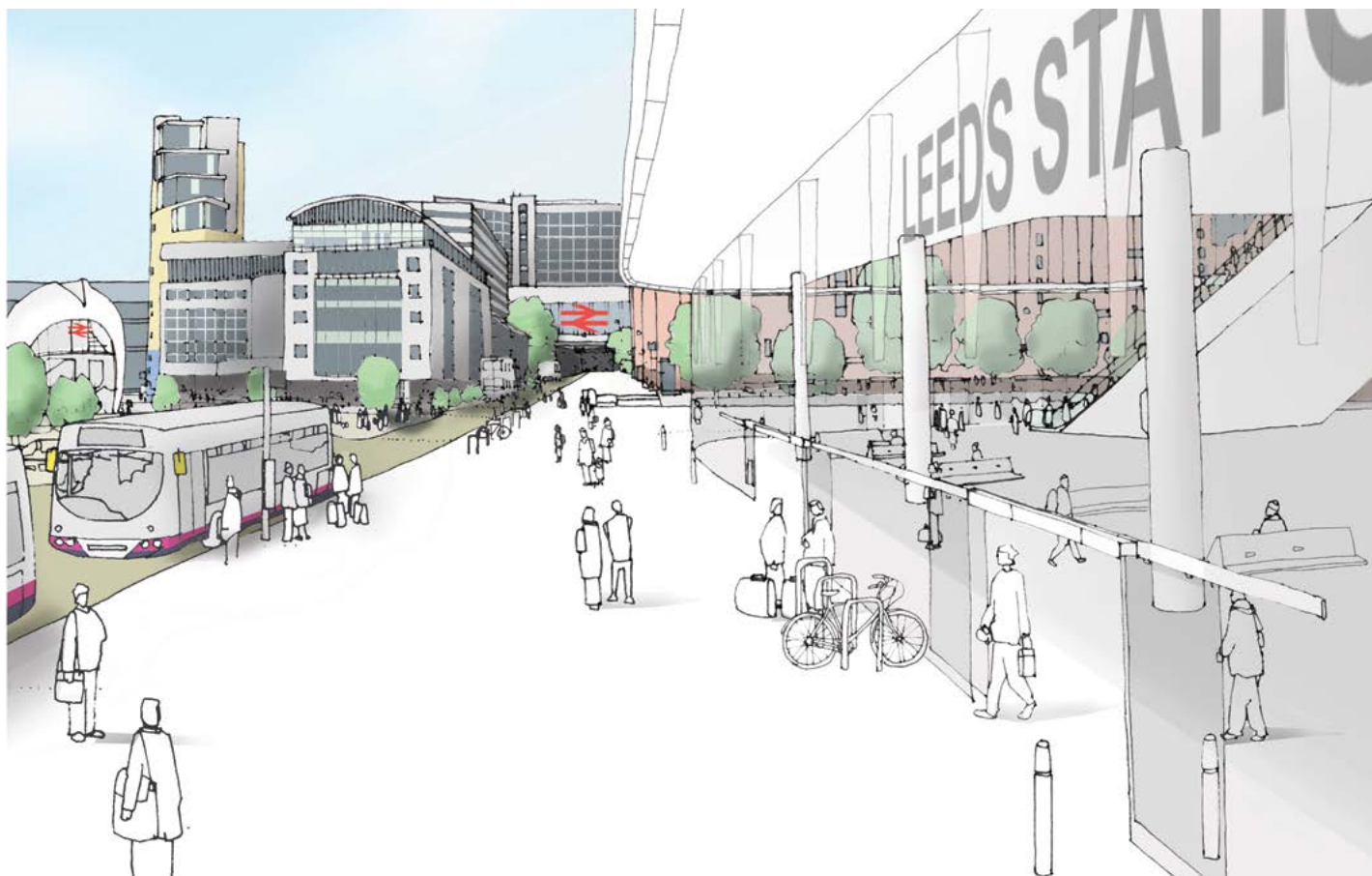
Visualisation of the proposed Leeds New Lane station at street level

Following Royal Assent to the Phase Two hybrid Bill, there would be a period to prepare for construction – for example, for land to be acquired and contracts let. Construction itself will take approximately nine years overall, although, in most places, the duration of construction is likely to be much less. In light of early analysis, we estimate that construction of the entire station would take around five years. This period of construction will include a period of testing from early 2031, with Phase Two expected to open in 2032/33. We recognise that people will be concerned about the impacts of construction on their area. We are committed to managing these impacts and reducing disruption to communities, businesses and the environment in ways that reflect the best practice used by the construction industry. We will work closely with local authorities and communities to draw up a comprehensive and detailed package of measures to address the local effects of construction.