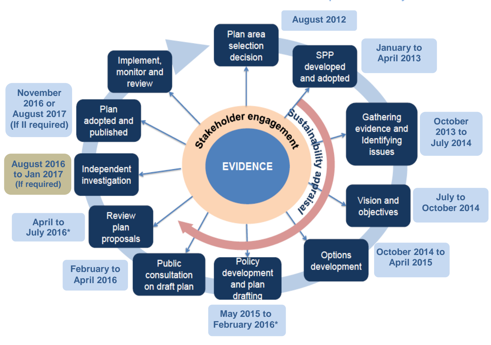
Figure 1: Stages and indicative timeframe for marine plan-making in the South Inshore and South Offshore Plan Areas. *The marine plans will spend a proportion of this time in Whitehall clearance. The MMO will maintain its engagement throughout this time.

'The dates indicted would need to be adjusted if an Independent Investigation were required'. Habitats Regulations Assessment and Impact Assessment will be undertaken alongside the Sustainability Appraisal.