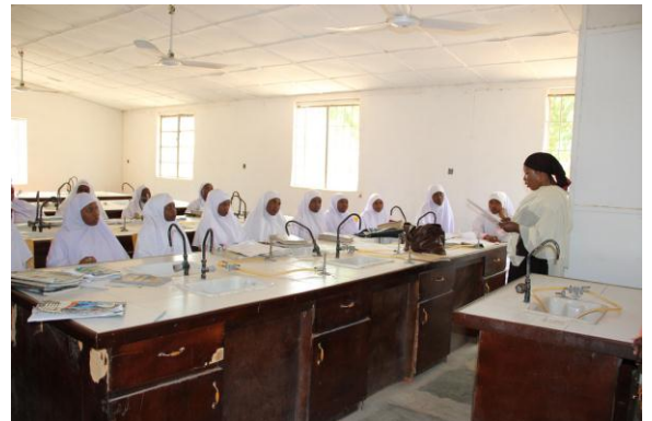
Women attending the Jigawa State School for Midwifery in Northern Nigeria

"Education offers a route out of poverty, giving girls the chance to shape their own future.... We need to work with the Government of Nigeria, with the United Nations, and with other partners, to support education in the country. And we need to continue to work across the world to keep schoolchildren everywhere safe."