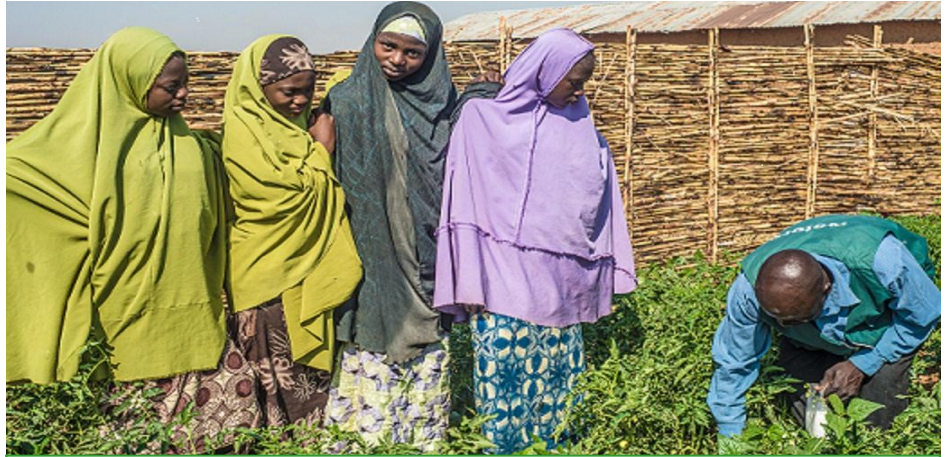
Young Women in Zaria State, November 2013 being shown the proper use of fertiliser to improve crops.

We supported elections where 40 million people voted in 2011 and will support elections in 2015 when 55 million people are expected to vote.