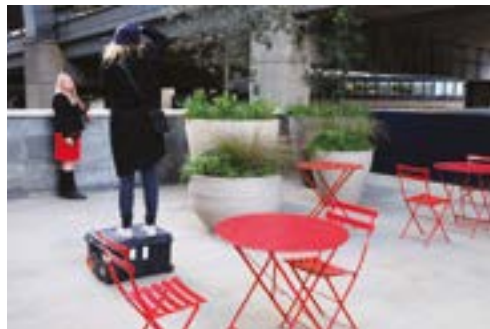
Pauline is pictured in a café opposite one of London's arterial roads, the Westway.

The training and support provided by Innovate UK has accelerated SOMI's progress, enabling them to raise their profile to an international level.