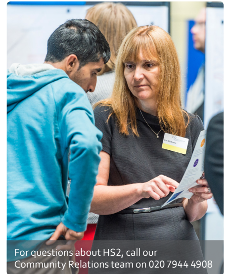
For questions about HS2, call our Community Relations team on 020 7944 4908

But before construction work starts, the government needs permission from Parliament. It sets out its plans in a hybrid Bill and supporting documents. This factsheet explains what a hybrid Bill is and how you can have a say.