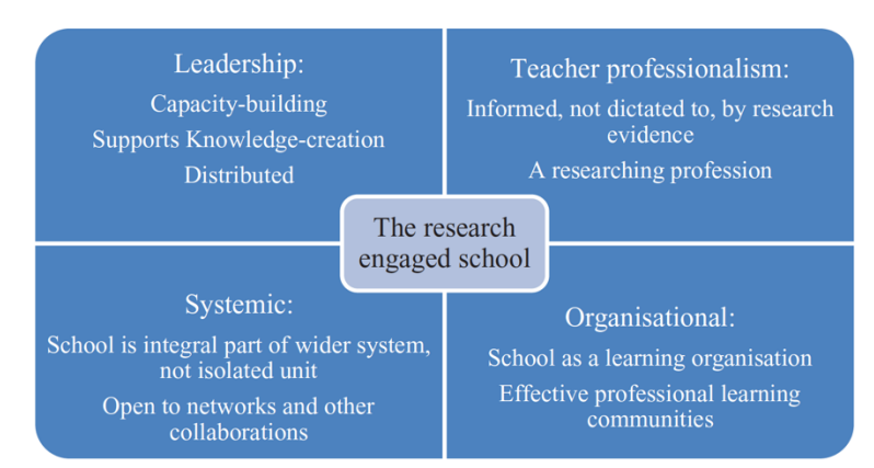
Figure 3: Godfrey's (2016) ecological model of a research-engaged school 'culture'

Overall the range of approaches, models and descriptive studies makes it challenging to summarise and define what evidence-based approaches are, so drawing conclusions about effective approaches is even more difficult. Perhaps the most helpful perspective is to consider it as a system with its own ecology (Godfrey, 2016) in which effectiveness can be evaluated once the aims and purpose are clear, but from which any more general conclusions need to be tempered by the contexts from which they are drawn (see Figure 3).