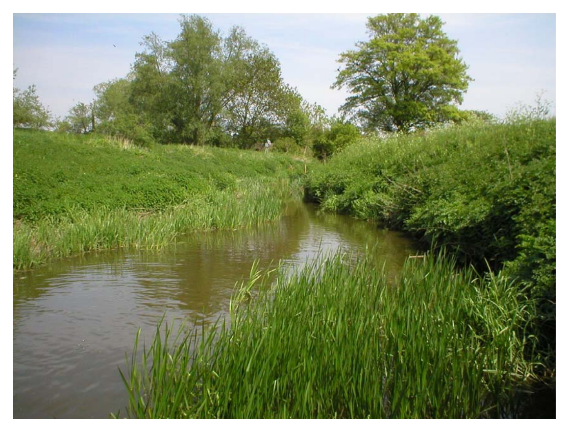
Plate 3.8 Section of River Eden exhibiting substantial recovery from plant cutting and dredging works