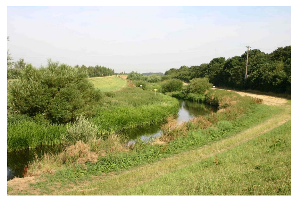
Plate 3.6 River Dearne: Downstream sub-reach showing re-meandering