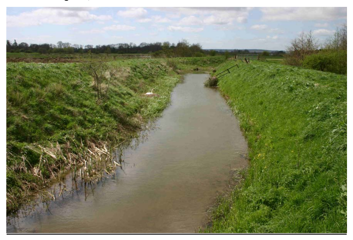
Plate 3.3: Long Eau, Downstream sub-reach