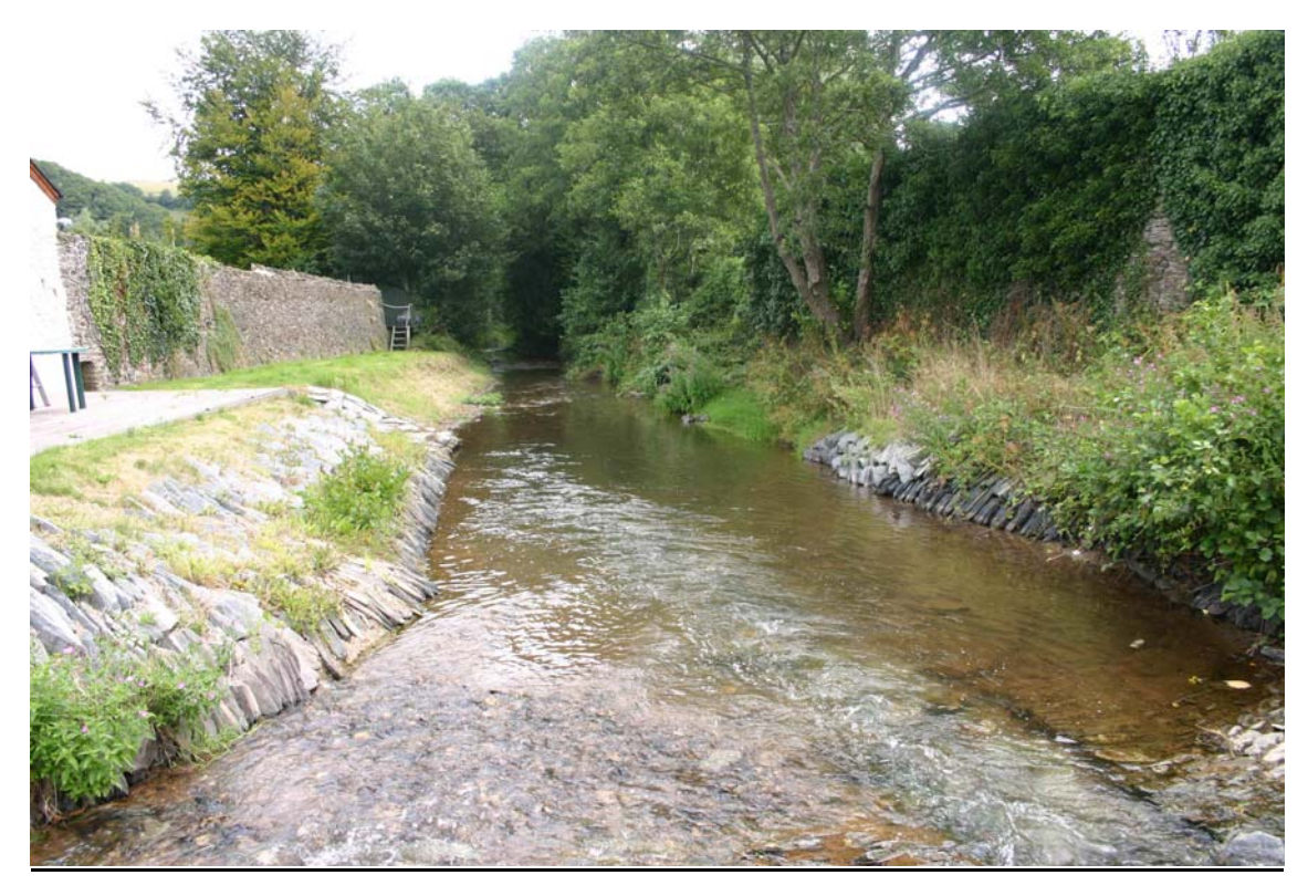
Plate 3.10 River Harbourne showing some of the works carried out in the centre of Harbertonford