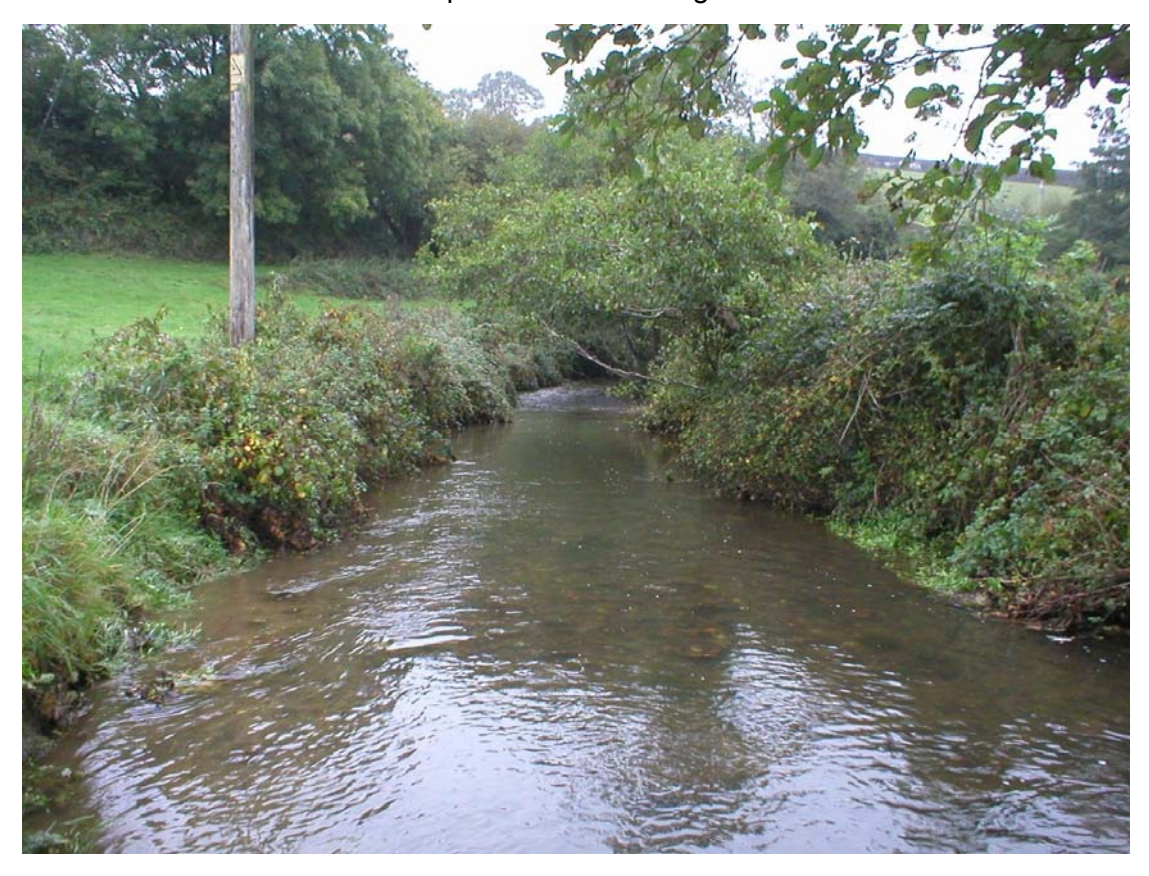
Plate 3.9: Reach of the River Harbourne upstream of Harbertonford

The reach of the Harbourne considered is related to the capital works carried out in Harbertonford to control the flood risk through the village. The village had been subject to frequent flooding in the past and one of the challenges of the proposed flood relief works was to reduce the flood risk by increasing the conveyance of the river channel but to maintain the sediment transporting capacity of the channel so that a long-term sediment maintenance commitment was not created. As part of the scheme a flood retention dam was constructed upstream of the village.