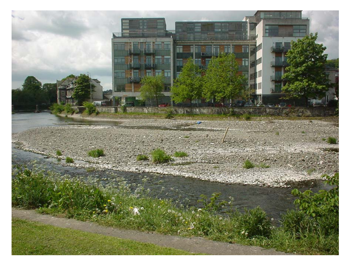
Plate 3.11 River Kent showing mid-channel gravel bar downstream of Stramongate weir