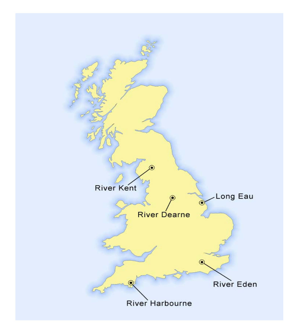
Figure 2.1 Locations of field sites

It should be stressed that the sites were selected to represent generic types of river and issues. The sites were studied to elucidate the aspects of sediment management that were of general application. It was not the intention of the project to develop detailed sediment management plans for the sites.