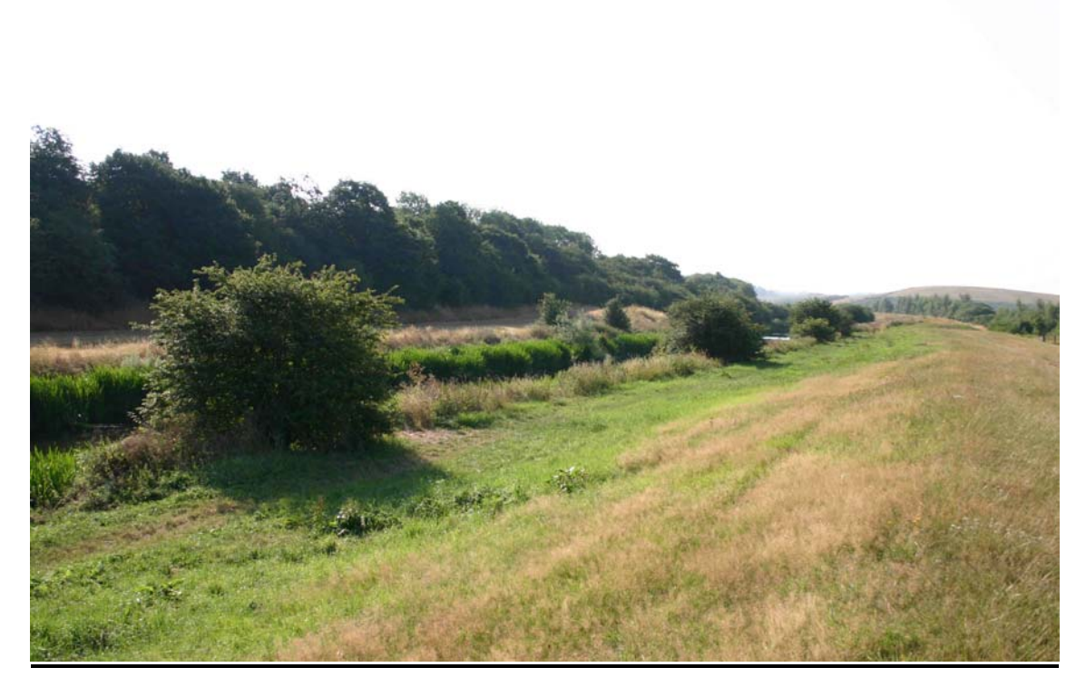
Plate 3.5 River Dearne: Middle sub-reach