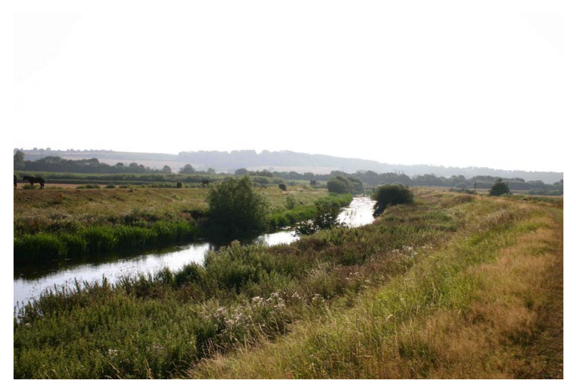
Plate 3.4 River Dearne: Upstream sub-reach