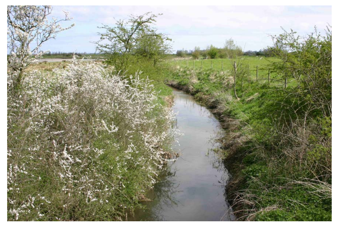
Plate 3.1 Long Eau: Sub-reach 1 looking downstream

The Long Eau is a low energy river system in Lincolnshire. Historically, overdeepening of the channel, coupled with the construction of high flood embankments, has reduced floodplain connectivity. In the upstream sub-reach an enhancement scheme had been carried out that involved lowering the right embankment to allow more frequent fluvial flooding of the adjacent wetland while in the middle sub-reach artificial riffles had been introduced. The study reach represented, therefore, an example of carrying out engineering works to improve a low energy stream. Vegetation cutting is also carried out in the reach and so the site gave the opportunity to investigate aspects of vegetation maintenance.