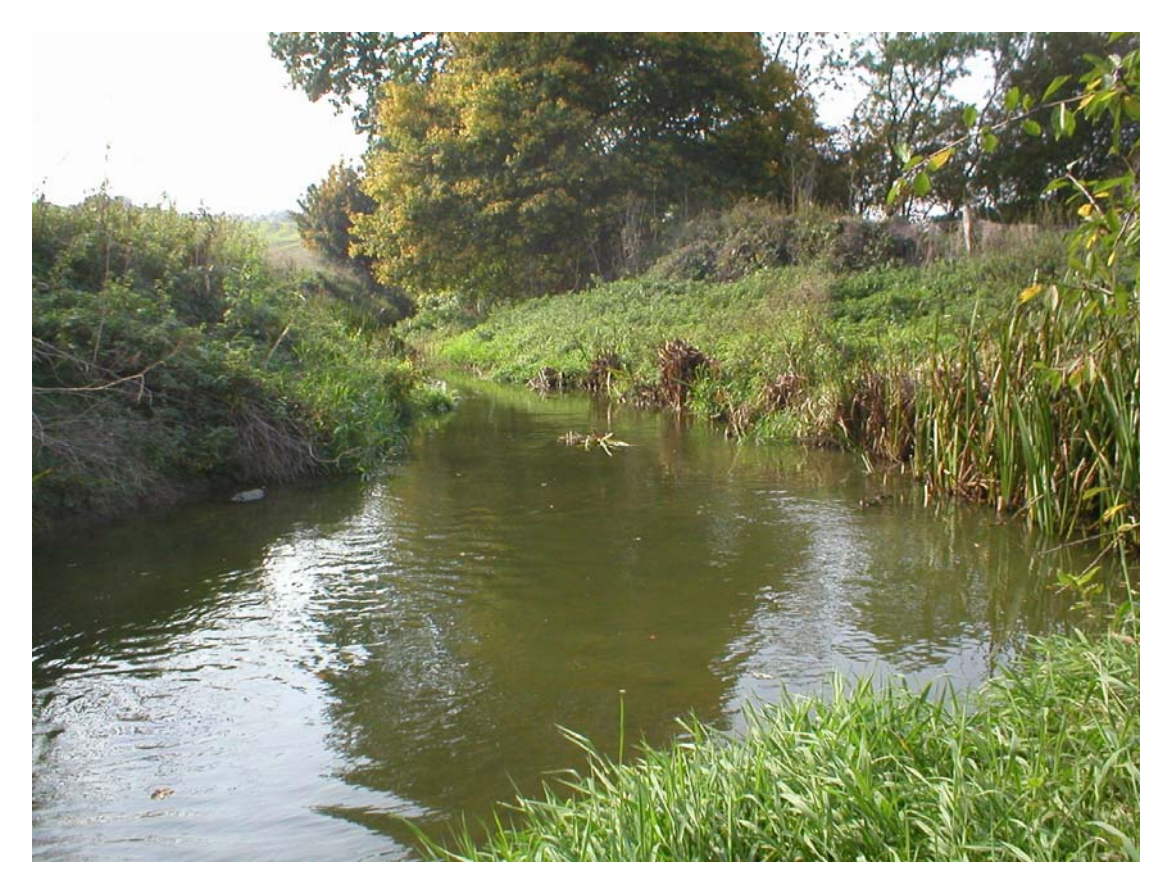
Plate 3.7 Section of River Eden recently subject to plant cutting and dredging works

The total reach of the river under study has been subject to periodic maintenance involving sediment removal and clearing vegetation. The difference between the study sub-reaches was the time period since the last maintenance had been carried out. The study reach thus demonstrates the impact of periodic sediment removal and subsequent channel recovery.