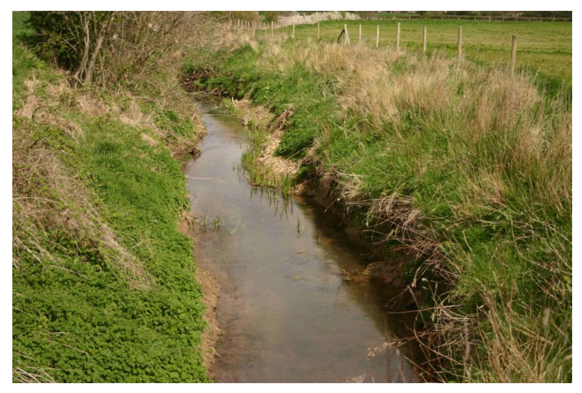
Plate 3.2: Long Eau, Middle sub-reach