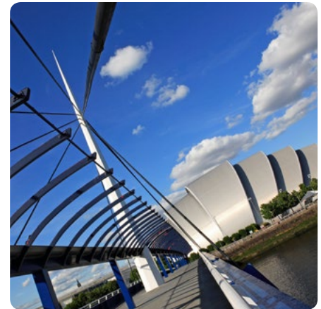
■ Scottish Exhibition and Conference Centre

HS2 services will reduce the journey time between Scotland's central belt and London to just over 3 and a half hours.