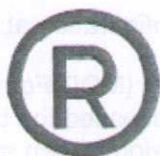
Figure 5 ADR DEF STAN marking