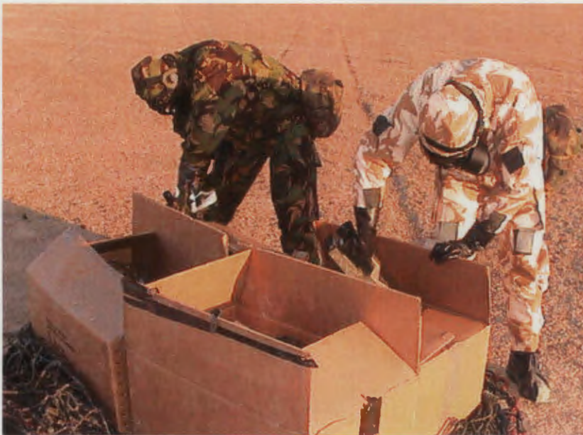
CBRN survey team checking boxes containing batched canisters.