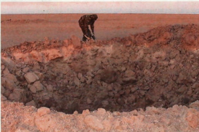
Destruction pit being checked for chemical contamination by CBRN team