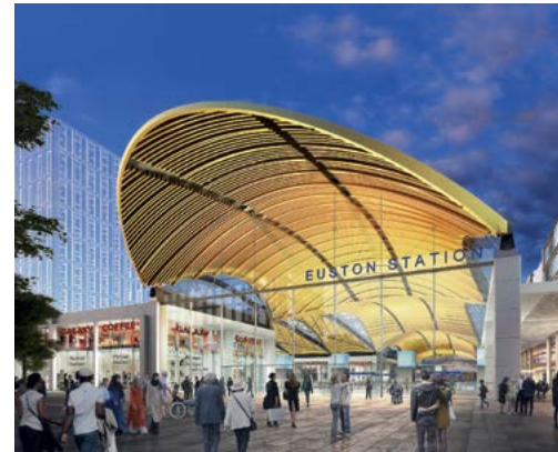
The proposed HS2 station at London Euston

We're extremely aware of the issues that building a new railway presents to those who live nearby, and we take our responsibility to you very seriously. Ultimately, we want to make HS2 mean something positive to everyone, whether it stands for fairness and clarity, better training for current and future engineers, a catalyst for jobs and investment in your area, a world-class railway or simply a new and exciting way to travel.