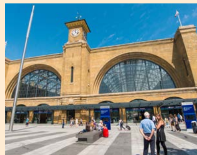
King's Cross St Pancras is an example of how redevelopment can transform an area

To view the route in more detail, please take a look at our interactive map at www.gov.uk/hs2