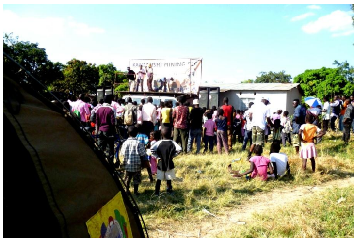
Figure 3. Community Road Show at Mushitala, Solwezi District

As noted by road show health volunteers, one of the main challenges facing the impact of these road shows is the lack of capacity for follow-up on positive HIV and malaria cases - after the festival feeling of the road show there is a large degree of uncertainty as to how many positive cases actual present at a local health facility for further tests and treatment.