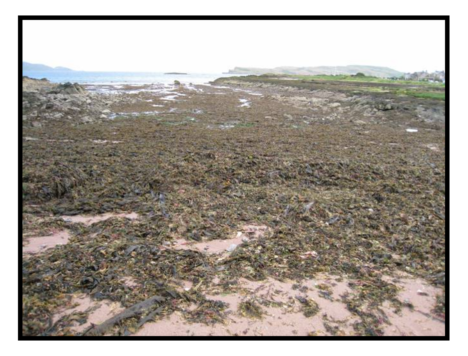
Figure 1 Example of amount of beach-cast weed blown ashore on small popular beach after strong winds, Foul Port, Great Cumbrae, May 2009.

Are seaweeds an issue on bathing beaches?