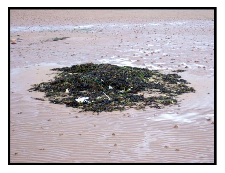
Figure 4 Algal 'hot-spot' on a sandy beach formed by sand being deposited on the small algal mound with gradual incorporation into the beach.

Pers. Obs. Figure 4). Other regimes may call for the deliberate burial of this material into the beach. Another in-situ technique utilized is where the algal material is deliberately aggregated into large mounds on the beach with subsequent reliance on natural degradation processes to reduce the beachcast material (Wither, Pers Comm.).