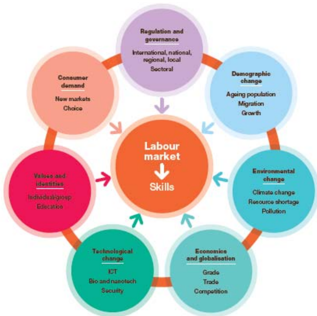
Figure 6.1 The major drivers of change