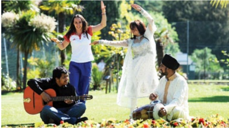
Left: Gymnast, Beth Tweddle takes part in the Indian dancing challenge with Sampad Mela to launch the West Midlands listings for the London 2012 Open Weekend.

We live in a world of increased connections and interdependence, and the UK has a long history of trading, cultural and sporting links with other countries. We have always thrived on the exchange of skills, goods and ideas. Our society is a strong fusion of different cultures and approaches.