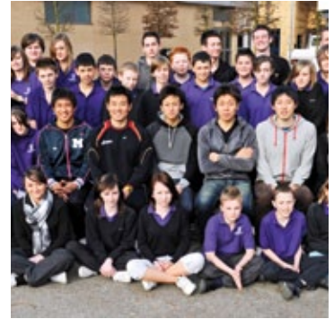
Left and above: The Musubi Project.

Have you considered hosting an event to celebrate the cultures of your community and the country you are hosting – whether it's visual art, music, film or food?