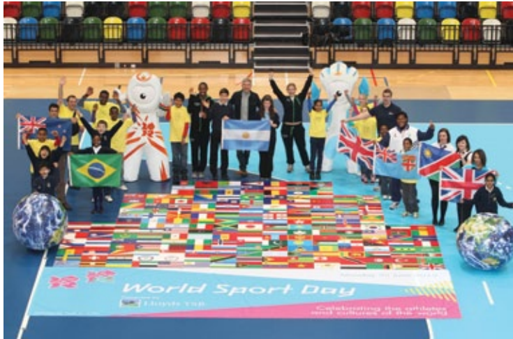
Left: Jonathan Edwards and local school children celebrate the launch of World Sport Day at the Copperbox on the Olympic Park.