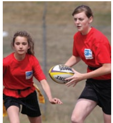
Above: The School Games initiative is helping more young people develop a sporting habit.