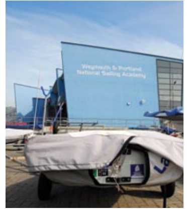
Above: Weymouth and Portland Sailing Academy will be used as a Pre-Games Training Camp by at least seven nations in the countdown to London 2012.

Teams have been steadily building their Games preparation in the last few years at venues across the UK, with activity increasing over the coming months. While for some these may be private affairs, others may be planning some form of engagement within local communities. This is still a great opportunity for communities and businesses to showcase themselves and, alongside both Torch Relays, is a real example of the truly UK-wide reach of the Games.