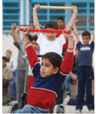
Above: The magic of London 2012 is being shared with the world through International Inspiration.

Schools can register for the School Games and find out more about the events happening in their area at: yourschoolgames.com