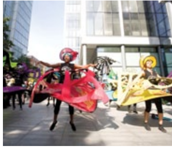
Above: British Business Club.