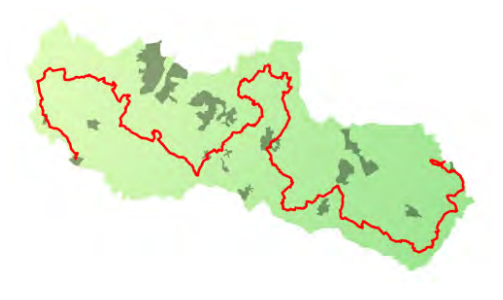
Left: Multi-use trails can work well Above: The National Forest long distance trail taking shape

The aspiration is that everyone who opens their front door in The National Forest knows that they can get to a green space which suits them. A good start has been made, and the proportion of people actively using the Forest's green corridors will massively increase over time.