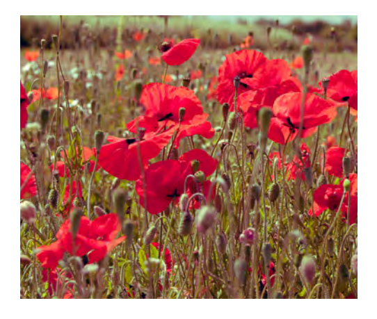
Left: There was a beautiful winter this year in The National Forest Above: Non-wooded habitats are vital to the Forest Right: Directors from Reabrook Ltd, sponsors of the

Despite challenging economic conditions, business sponsors have continued to support the Forest generously and have been proud to be associated with it. We are most grateful for their engagement, which often goes beyond the initial financial contribution.