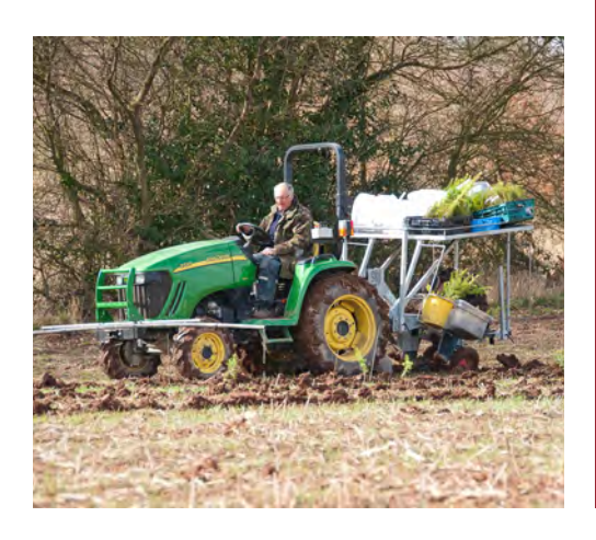
Left: Woodland creation co-exists with thriving agriculture Above: Precision planting with a customised trailer Right: Sence Valley near Heather maturing well

We met our target for forest creation. The total number of new forest sites achieved is lower than last year, which reflects resources and a buoyant land market and agricultural sector. However the hectarage includes some big sites grant funded under the Changing Landscapes Scheme, which had a strong year. This was supplemented by a major acquisition which then fortuitously was able to form a big part of the Flagship Diamond Jubilee Wood. With significant development-related forest creation, this year demonstrated the value of having a well-established reputation and a range of mechanisms with which to achieve new planting at scale. At the same time, management and education of landowners gathered pace towards the critical years in which first thinnings will take place.