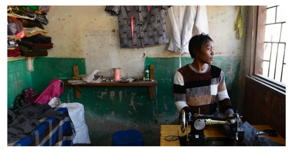
B uilding Young Futures trainee in Zambia, supported by the Zambia Child Grants Programme.

Impact of school violence on educational outcomes in Malawi (September 2017). This Population Council brief examines the relationship between violence at school. student retention and educational outcomes. through analysing data collected from nearly 1.800 adolescent students over a 7 year period. The research finds that school violence does not disrupt schooling - with the exception of sexual violence experienced by school boys.