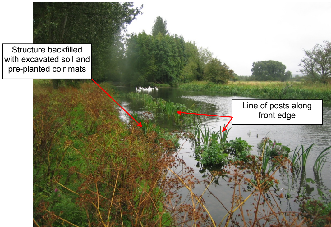
Figure 3.1 Channel narrowing berm in 2008 (one year after installation)

structure and soil was used to backfill the structure. The brushwood and soil were then topped off with pre-planted coir mats and the whole structure was cross-wired together. The coir mats had been planted with reed canary grass, water mint, yellow flag, water parsnip and marsh marigold. The deflectors narrowed the channel by 3–3.5m.