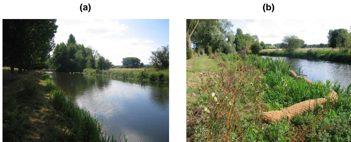
Figure 3.2 Upstream of Seven Hatches (a) before (2006) and (b) after (2009) construction of beam to narrow the channel

The photographs in Figure 3.2 were taken upstream of Seven Hatches and show the berm constructed to narrow the channel. The berm has become colonised by emergent vegetation and is likely to be increasing flow velocities in this section of the reach.