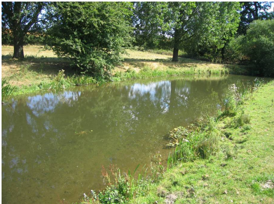
Figure 2.4 Slow uniform flow conditions due to historical modifications

Riparian vegetation had also been restricted by cattle grazing on the adjacent floodplain and a line of poplar trees on the left hand bank was resulting in overshadowing along the reach.