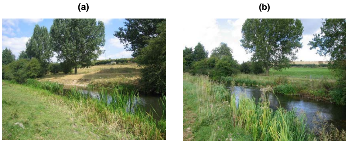
Figure 3.3 Downstream of Seven Hatches (a) before (2006) and (b) after (2009) construction of a gravel riffle

Figure 3.4 shows the increase in emergent vegetation at the channel margins between 2006 and 2009. There was also an increase during this period in the height of riparian vegetation in response to restricting livestock access.