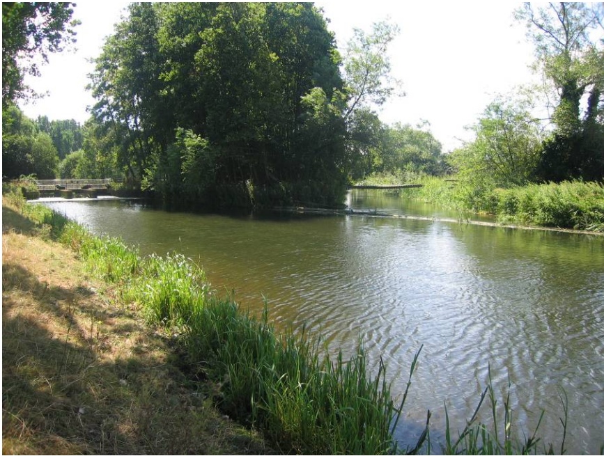
Figure 2.3 Impoundment upstream of Seven Hatches

local name are impounding upstream water levels with associated deposition of fine sediments (Figure 2.3).