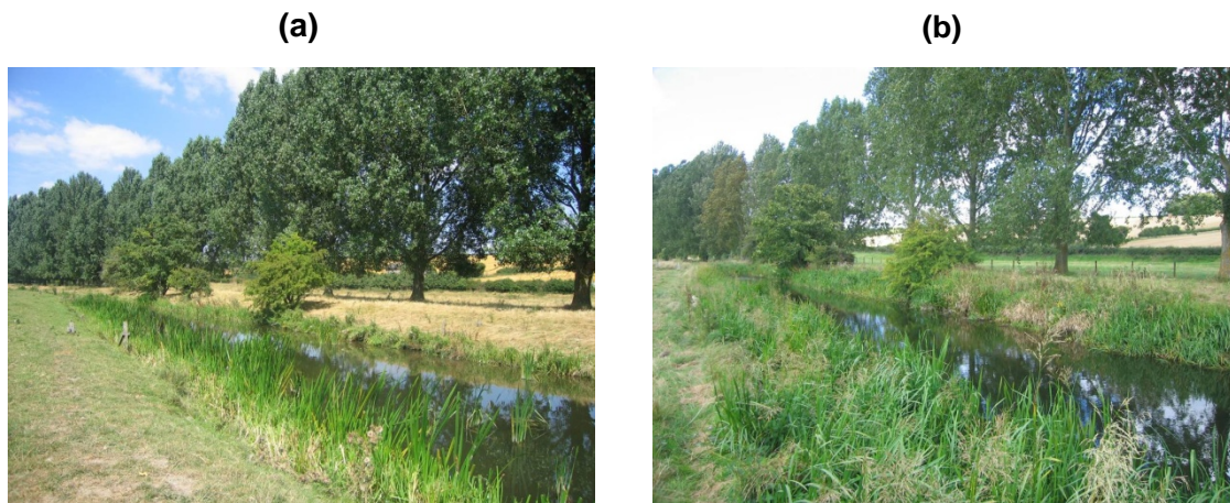
Figure 3.4 Extent of emergent vegetation at the channel margins downstream of Seven Hatches (a) before (2006) and (b) after restoration (2009)

Figure 3.4 shows the increase in emergent vegetation at the channel margins between 2006 and 2009. There was also an increase during this period in the height of riparian vegetation in response to restricting livestock access.