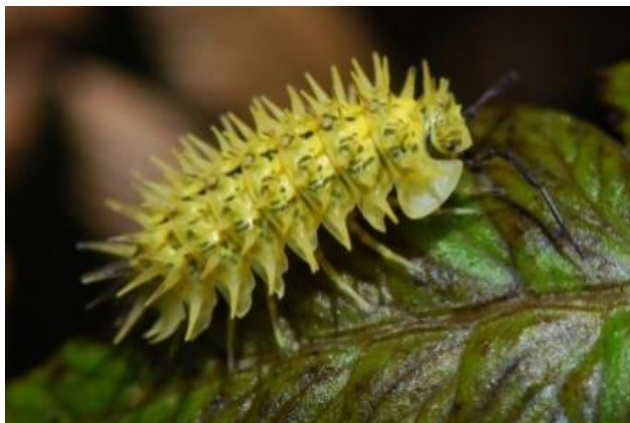
Figure 7: Spiky Yellow Woodlouse of St Helena ( EIDCF004 and Flagship Species Fund project )