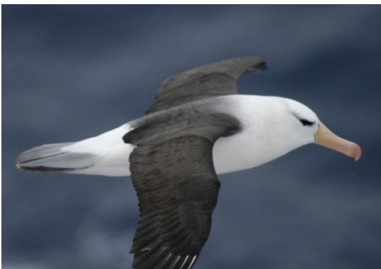
Figure14: Blackbrow Albatross, Falkland Islands (18-019)

Building on this success, the UK's delegation to the 11 th Conference of the Parties to the Convention on Biological Diversity (CBD CoP11) in Hyderabad, India, in October 2012, included a marine expert from Bermuda, who provided support and input in relation to the CBD's programme of work on Marine and Coastal Biodiversity.