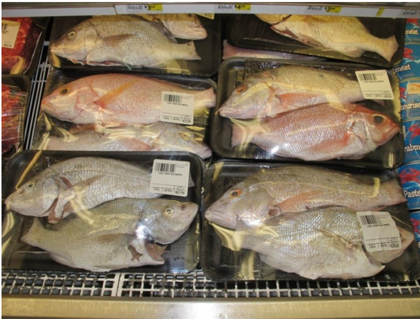
Figure 11: Turks and Caicos Fish ( EIDCF010 )

it seeks to improve the sustainability of its fisheries through an improved licensing and monitoring regime.