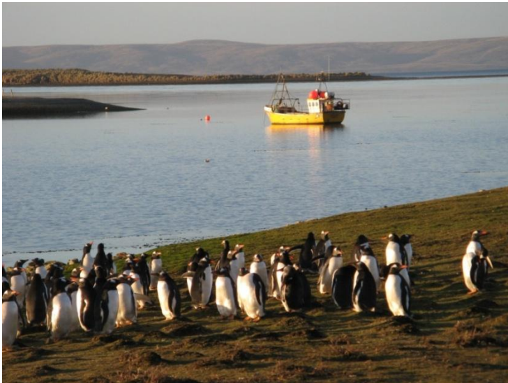
Figure 12: Penguins in the Falkland Islands ( EIDP0041 )

Currently Bermuda, the British Virgin Islands, the Turks and Caicos Islands and St Helena are the UK OT members of the International Commission for the Conservation of Atlantic Tunas (ICCAT). The FCO works together with the OTs in meeting the commitments that ICCAT membership entails. For example, submission of UK OT data to the ICCAT Secretariat is co-ordinated by the FCO to ensure the compliance with the extensive reporting and monitoring obligations required, when fishing in line with ICCAT recommendations. The FCO has also provided technical expertise regarding ICCAT requirements in the context of St Helena's current pelagic exploratory fishery.