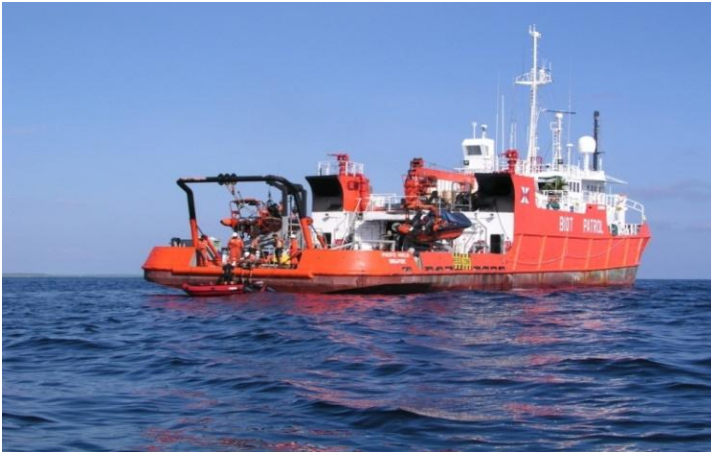
Figure 8: BIOT Patrol Ship (19-027)