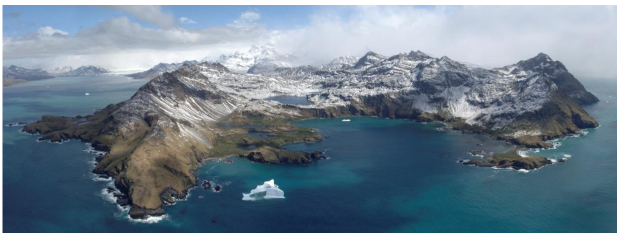
Figure 2: Myviken, South Georgia (18-019)

The Governor's Office in the Turks and Caicos provided funding for the equipment and certification necessary for ten Department for Environment and Maritime Affairs officers to receive a full-day's open-water training on lionfish control, involving techniques in safely capturing and handling the fish. The training is an important step towards the development of a strategy to control lionfish numbers in the Territory's waters.