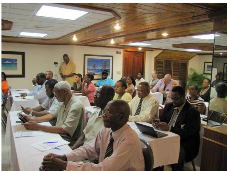
Figure 10: Anguilla Lionfish Workshop