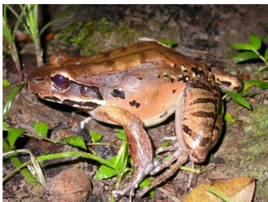
Figure 5: Mountain chicken frog in Montserrat (18-018)

Main projects have included saving the critically endangered mountain chicken frog in Montserrat and developing a sustainable marine and fisheries plan for the Pitcairn Islands. A Challenge Fund award in 2010 paved the way for a current main project (2012-2015) looking at reducing conflict between raptors and sheep farming in the Falklands.