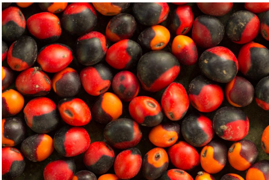
Figure 4: Seed collection in the Caribbean ( DPLUS006 )

Environmental Mainstreaming is an innovative approach by the UK Government to help the Territories put environmental considerations at the heart of decision making. Projects have been completed in the Falklands, British Virgin Islands (funded by the FCO) and Anguilla (funded by Defra). We are in the process of extending the initiative to Bermuda and the Turks and Caicos Islands.