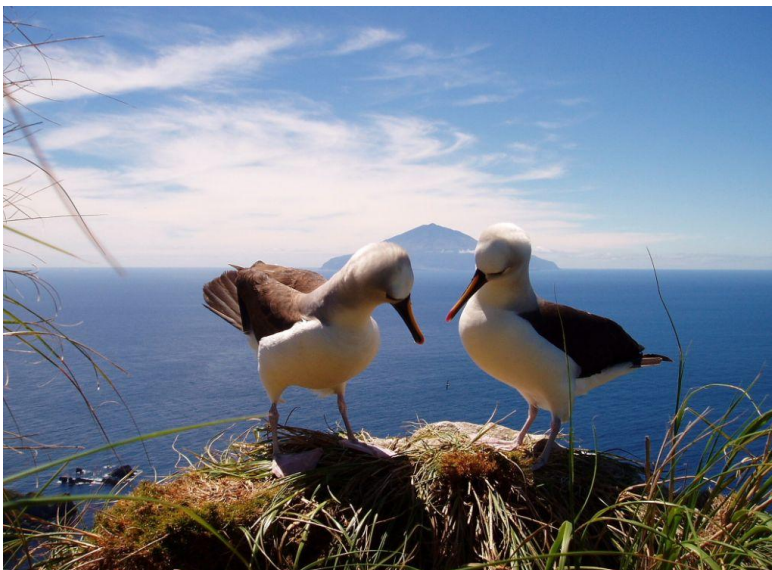
Figure 6: Albatross on Nightingale Island with Tristan in the background (12-010)

The first two rounds of Darwin Plus have seen approximately £4m supporting twenty-nine projects across the Territories, including projects ranging from habitat restoration in the South Atlantic Territories to mapping marine habitats in the Caribbean.