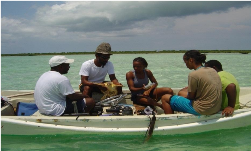
Figure 13: Turtle work in the British Virgin Islands (12-023)

Case Study 16: Implementing the Hamilton Declaration on Collaboration for the Conservation of the Sargasso Sea.