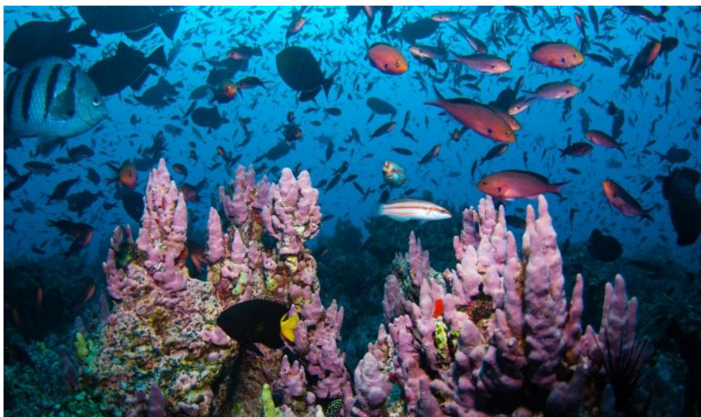
Figure 9: Coral biodiversity in Ascension ( EIDCF012)

JNCC is pursuing a strategy that aims to provide support for both small-scale Territory and Dependency-proposed projects as well as more strategic work that supports both long term OT capacity building and UK Government policy objectives. Under the research contribution scheme 4 , JNCC is periodically able to offer financial contributions to biodiversity research in the UK Overseas Territories and Crown Dependencies. Up to two invitations will be issued each year to members of the 'UK Overseas Territories and Crown Dependencies Steering Group', inviting them to submit requests for contributions to biodiversity research projects.