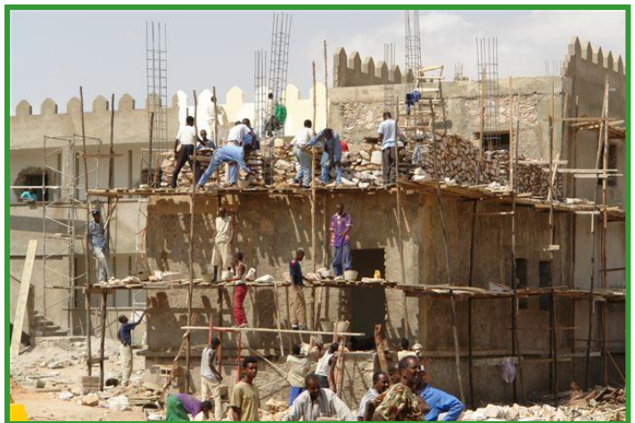
Re-building Mogadishu after two decades of conflict. DFID has generated over 724,000 days of direct employment from construction opportunities and cash for work activities rehabilitating productive infrastructure.

The UK Government is committed to ensuring optimal international support for Somalia. Capitalising on the success of the London Conference in February 2012, a second Conference in May 2013, co-hosted by the Prime Minister with the Somali President, focused on delivering coordinated international support for the President's priorities: security, justice, public financial management and building political stability.