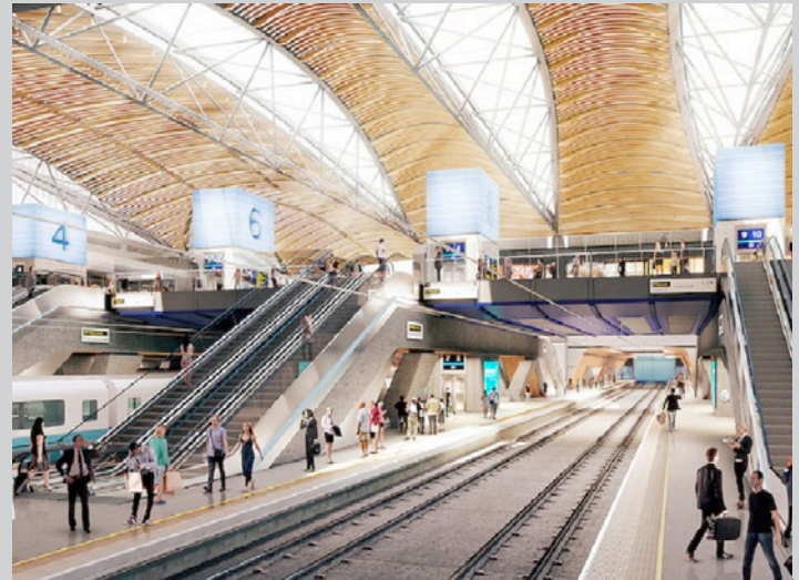
HS2 vision for Euston Station platform

This was the fifth time that the panel has been invited to comment on station design procurement. At an early stage, the panel's advice was sought at mentoring sessions. As the strategy was developed, further meetings were held to provide more detailed comments, with an emphasis on achieving the best outcome in terms of design quality, cost and risk.