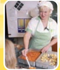
Profession Dinner Lady – Firefighter

“The job and the work that it entails appealed to me because of a strong sense of what I am doing for my community.”