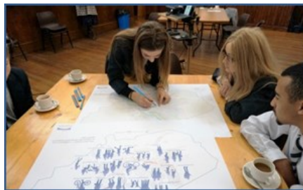
Neighbourhood Planning workshop with students, South Downs

Reaching the 100 th referendum in October, and the 126 th two months later shows just how much momentum has built up behind neighbourhood planning. To capitalise on this enthusiasm and appetite within communities to plan for their future, we are taking actions to ensure that even more people are able to benefit from the policy: