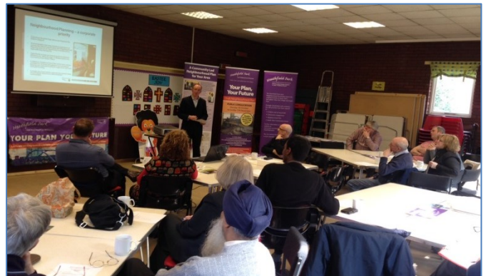
Beeston (Leeds) neighbourhood planning visit to Heathfield Park (Wolverhampton)