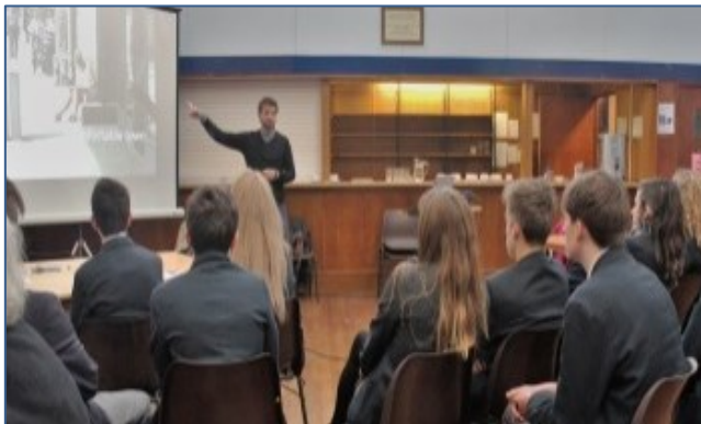
Neighbourhood Planning workshop with students, South Downs

local communities can allocate land for housing through neighbourhood plans, even if that land is not allocated in the Local Plan. Strumpshaw (Broadland) , where the neighbourhood plan allocated a site for a new community centre and allotments, with an enabling housing development for 10 new homes, is one such example. We'll be looking to ensure planning guidance is clearer on this.