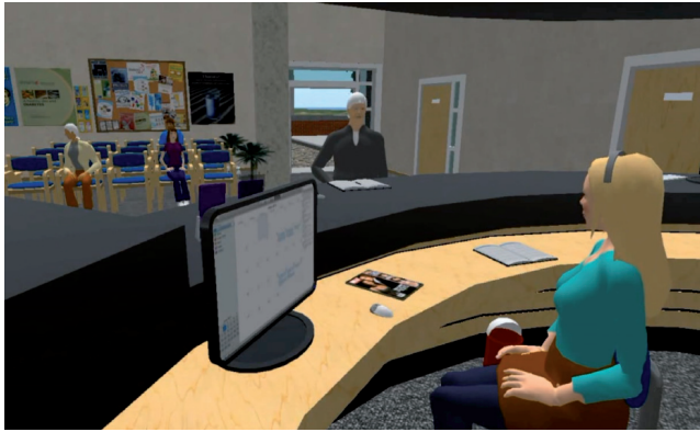
Above: Hao2 virtual environment

Please share what challenges you face as a DPULO. How have you overcome them? Is there a question you need advice on, or just let us know what you would like to see in the future issues, email odi.businessperformance@dwp.gsi.gov.uk