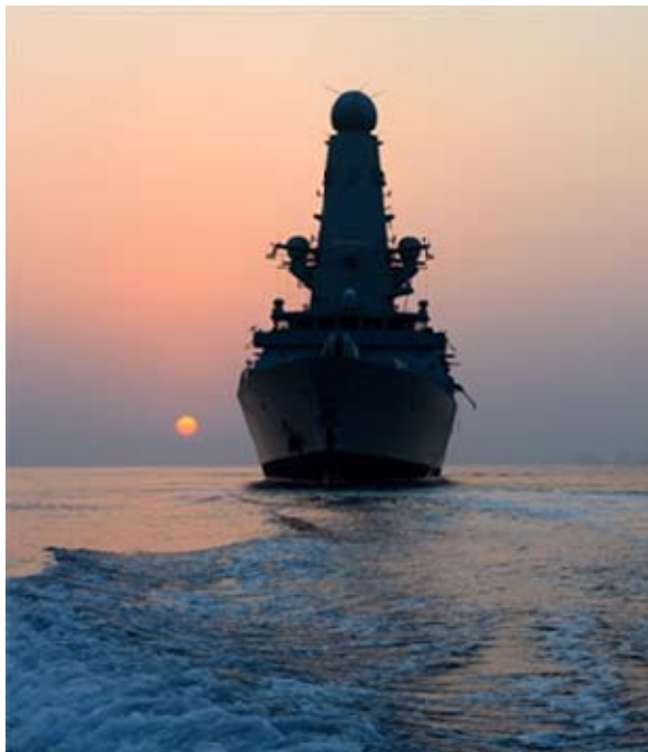
Figure 3: Type 45 destroyer HMS Dragon pictured in the Middle East during Op KIPION 2013

2 From 1 June 2011 (earliest date casualty data was available for Op KIPION)