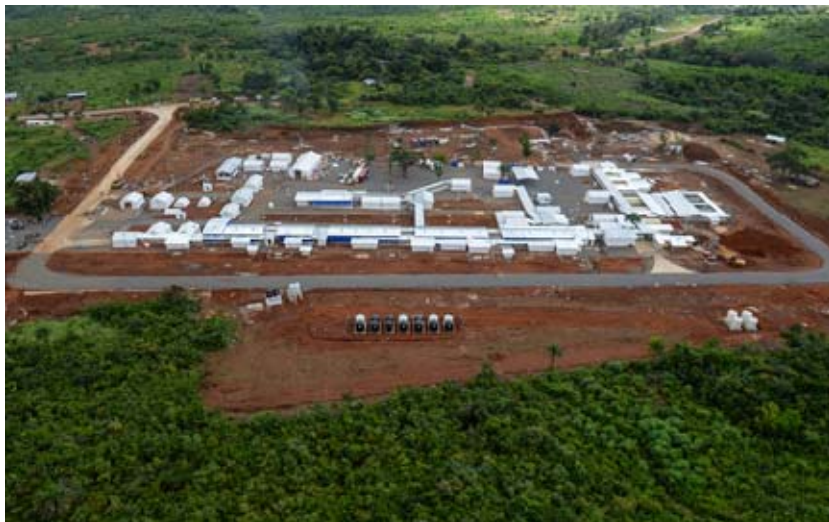
Figure 4: The Kerry Town Treatment Centre in Sierra Leone near the capital Freetown.

An Ebola treatment facility opened on the 5 November 2014 in Kerry Town, near the Sierra Leone capital Freetown. This facility was run by UK Military until 30 June 2015 when it was handed over to Aspen Medical by the deployed military team. The Kerry Town complex included an 80 bed treatment centre managed by Save the Children and a 12 bed centre staffed by UK military medics specifically for health care workers and international staff responding to the Ebola crisis. This section focuses only on those patients that were admitted to the 12 bed Health worker treatment centre run by the UK military.