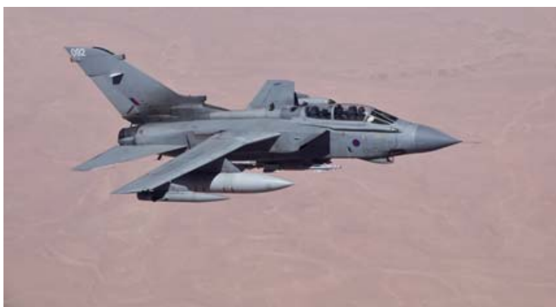
Figure 2: RAF Tornado GR4's over Iraq on an armed reconnaissance mission in support of Op SHADER.

During the latest quarter, 1 October 2016 to 31 December 2016 (Q3 2016/17) there was one UK Entitled Civilian who sustained an injury or illness whilst on operations.