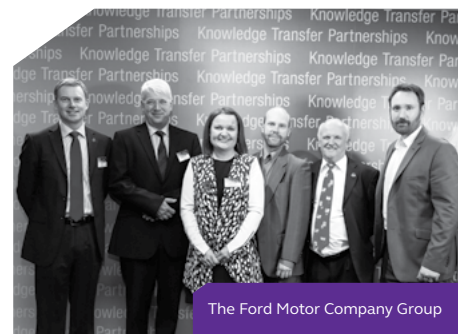
The Ford Motor Company Group

The main output from the project, however, has seen significant cost savings and work is being done to reapply the process to deliver additional factory output and profit – and ultimately protect jobs at the plant.