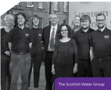
The Scottish Water Group