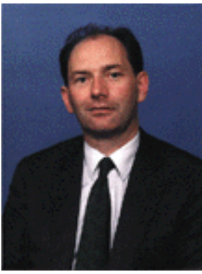
The Rt. Hon. Michael Forsyth MP Secretary of State for Scotland February 1997