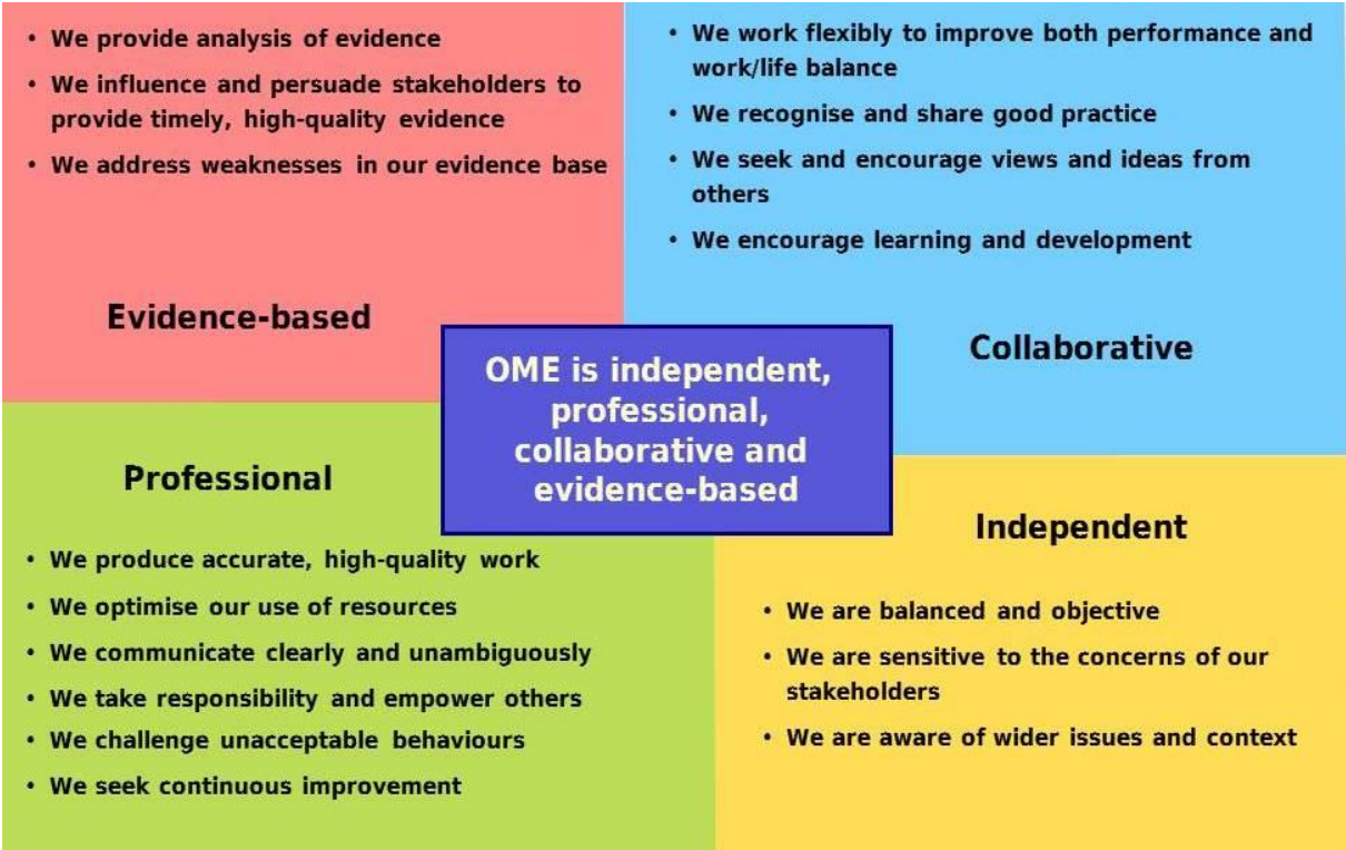
Figure 2: The OME values and behaviours

1.7 The OME values and behaviours shown below help staff to ensure that their work for the Pay Review Bodies is independent, professional, collaborative and evidence-based.