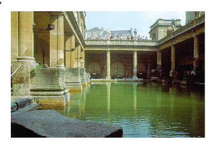
The Great Roman Bath at Bath