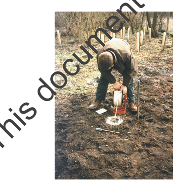
Agency staff measuring groundwater levels using a borehole

When the results of the survey, a where necessary the Environmenta Appraisal, are satisfactory, the Agency will issue a Consent. This allows the work to proceed subject to conditions. There are two kinds of conditions, a sample general