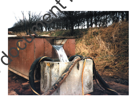
V-notch weir tank measuring discharge rate during pumping test

Drilling waste is normally classed as 'controlled waste' and disposal must comply with the Waste 13/201 Management Duty of Care: A Code of Practice.