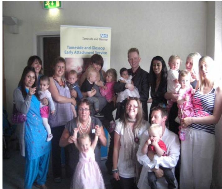
Photo: Local families who feature in the 'Getting it Right from the Start' DVD and booklet