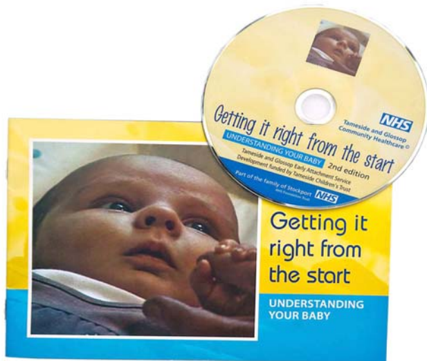
Start’. Photo: ‘Getting it Right from the Start’ Booklet with DVD

At its base, universal promotion of early attachment is achieved by the distribution to all new or expectant parents a locally produced booklet and DVD ‘Getting it Right from the