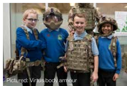
Pictured: Virtus body armour

DE&S engineers will continue their support of the competition by attending the schools and being interviewed by pupils about engineering and their designs before the competition deadline in March. This will importantly enable DE&S' STEM ambassadors to talk to school children about the importance