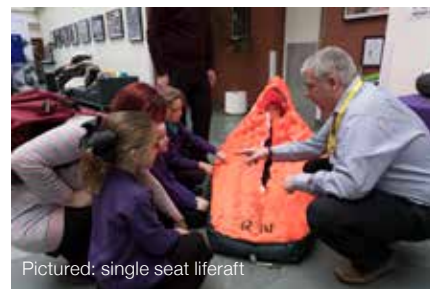
Pictured: single seat liferaft

of engineering while also increasing their understanding about who DE&S are.