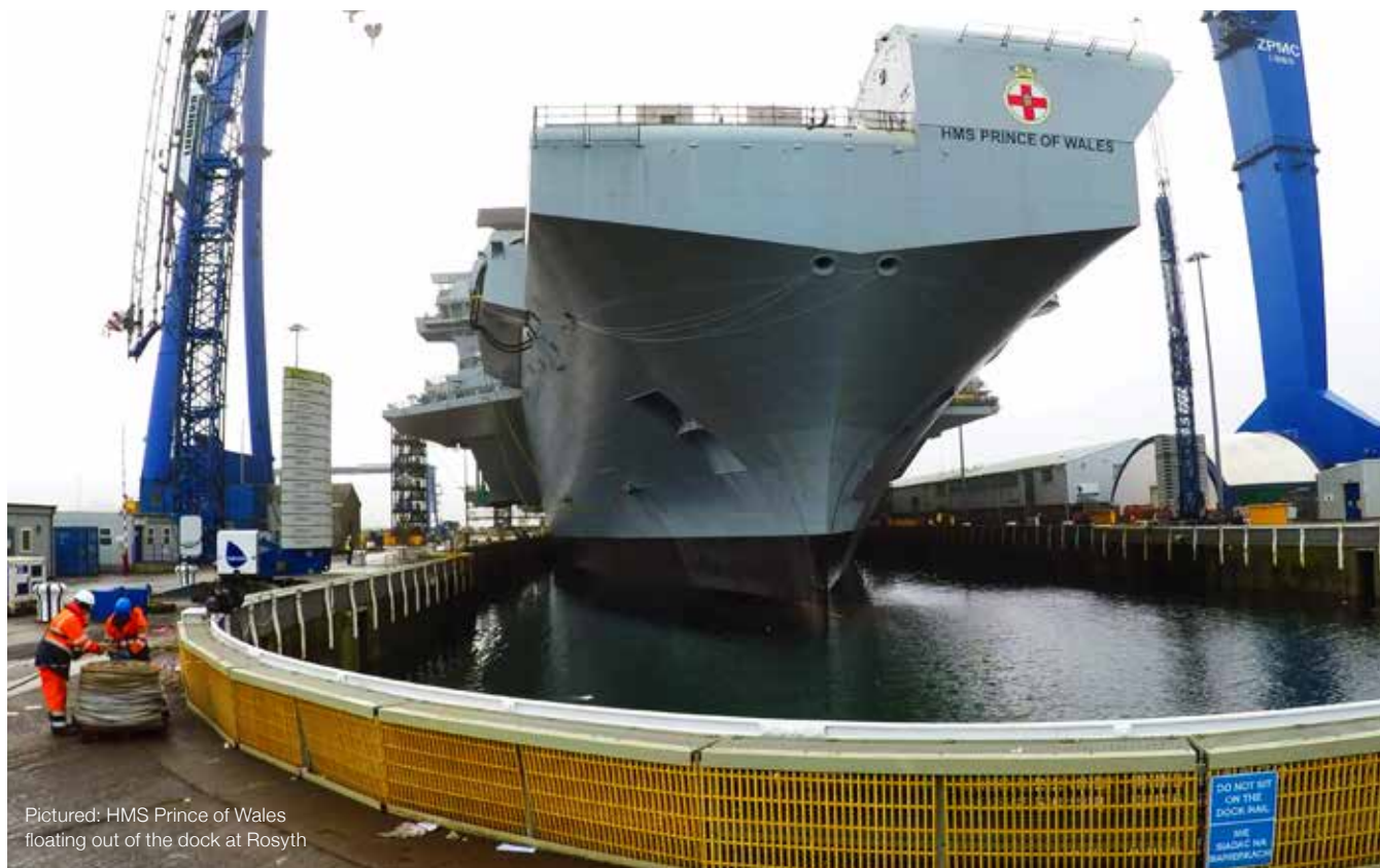
Pictured: HMS Prince of Wales floating out of the dock at Rosyth