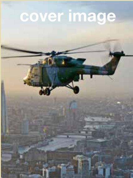
Pictured: A Lynx helicopter over London at sunset during the final commemorative tour