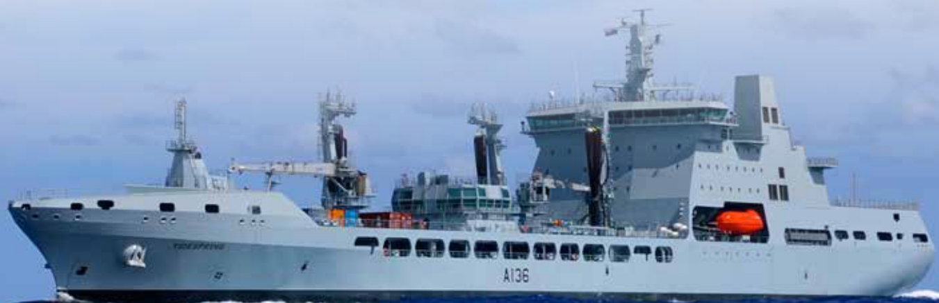
Pictured: Tidespring on her Delivery Voyage to the UK