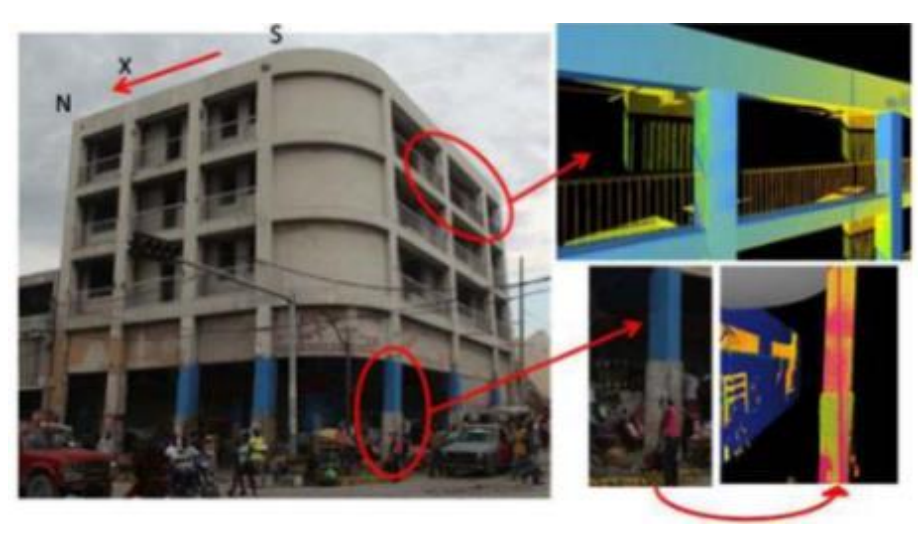
Figure 5: Condition assessment using laser scanning technique, healthy top beams and columns (top right image) and deformed ground columns (bottom right image).

Mosalam et al. (2014) reported the application of laser scanners for assessing the condition of structures. A case study was conducted in post-earthquake Haiti where the result of high-definition laser scans with 4mm accuracy were compared with visual inspection results. An example of the survey conducted in Haiti is presented in Figure 5, which shows the identified deformed members (beams and columns) of the structures. The system application as a quality assessment tool after any new construction was discussed. The 3D reconstruction of an as-built asset can be used within a BIM system to identify differences between what has been built and what was designed. The reconstruction can also provide a realistic record of the structure.