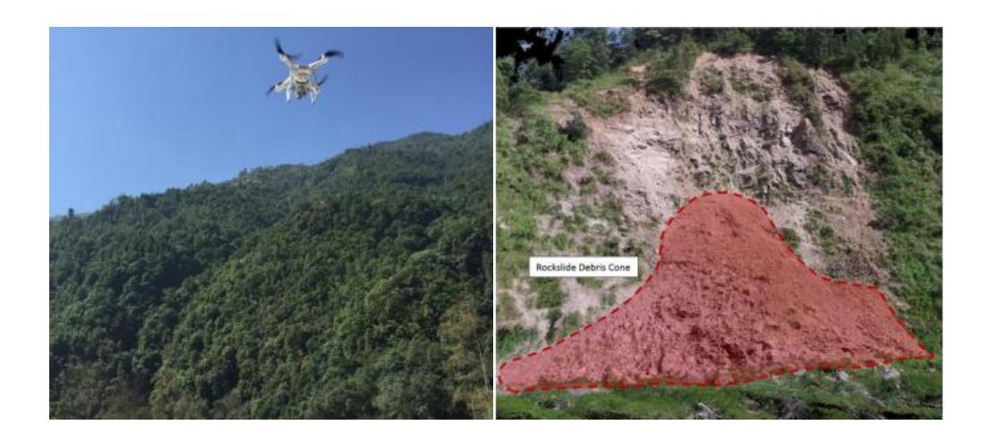
Figure 6: Example of utilising drones (a) for landslide detection (b) in Nepal

UAVs have also been used in geotechnical investigation projects in LICs, for instance Greenwood et al. (2016) successfully utilised images obtained by drones for detecting landslides in Nepal (Figure 6). Satellite images were similarly used by Kayastha et al. (2012); Ningombam et al. (2014); Sharma et al. (2017); and Xiao (2017) for landslide detection in Nepal.