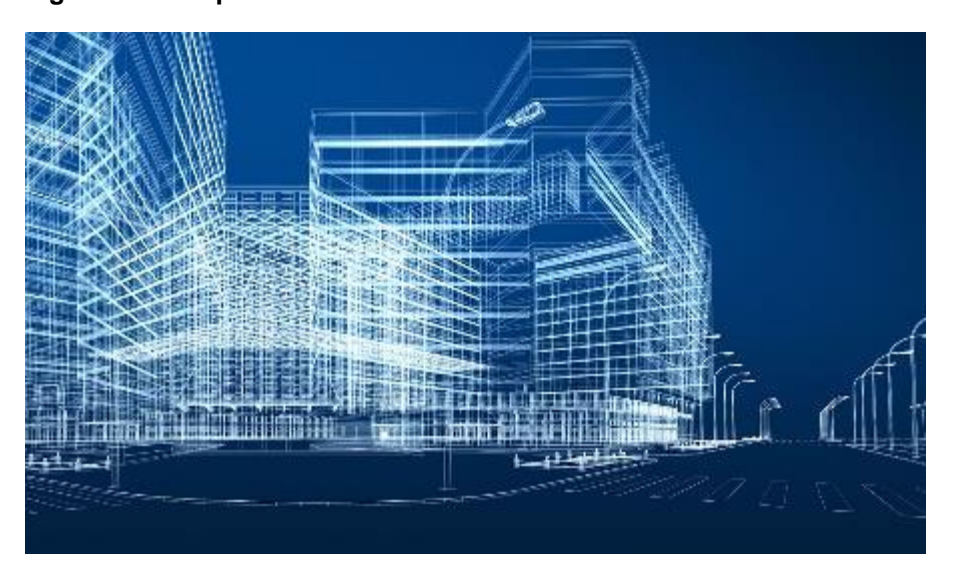
Figure 1: Example of a BIM model