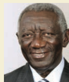
JOHN KUFUOR Global Panel Co-Chair and former President of Ghana