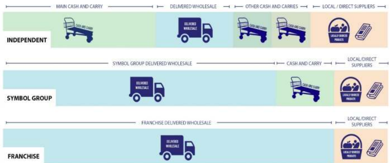
Figure 1: Illustration of suppliers to independent convenience retailers

There will be many retailers operating with some combination of these models, and many retailers will use more than one of each type of wholesale supplier.