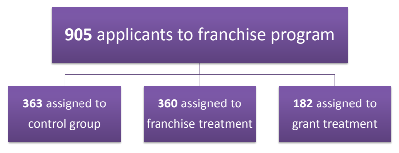
Figure 2: Assignment to treatment

To measure the impacts of the interventions on applicants assigned to each group, we conducted a midline survey 7-10 months after treatment and an endline survey 14-22 months after treatment.