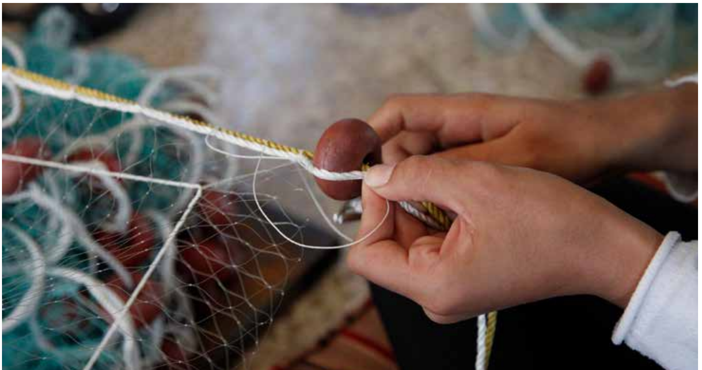
Fixing a fishing net as part of a project to help refugees earn an income in Lebanon.