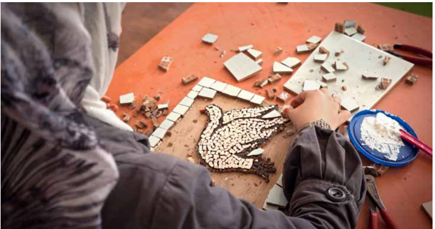
A worker in UN Women's mosaic workshop in Zaatari camp.