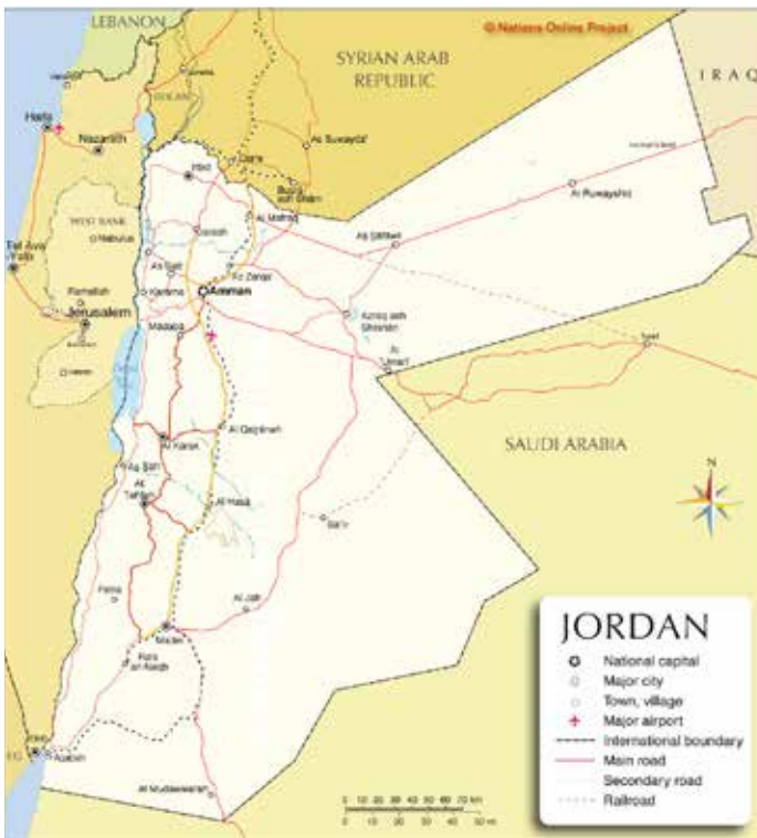
Figure 1: Map of Jordan with research areas in northern governments highlighted.

research. Techniques included participant observation; key informant and in-depth interviews (donors, UN agencies, NGOs, CSOs, businesses and service providers); focus group interviews with local Jordanian and Syrian community leaders (10 interviews with 4-6 individuals per group); focus groups with Jordanian and Syrian community women using ethnographic tools (11 groups with 8-12 individuals each); and in-depth case studies (5) with selected Syrian refugee women. In total, the research included over 200 respondents (see Appendix 1).