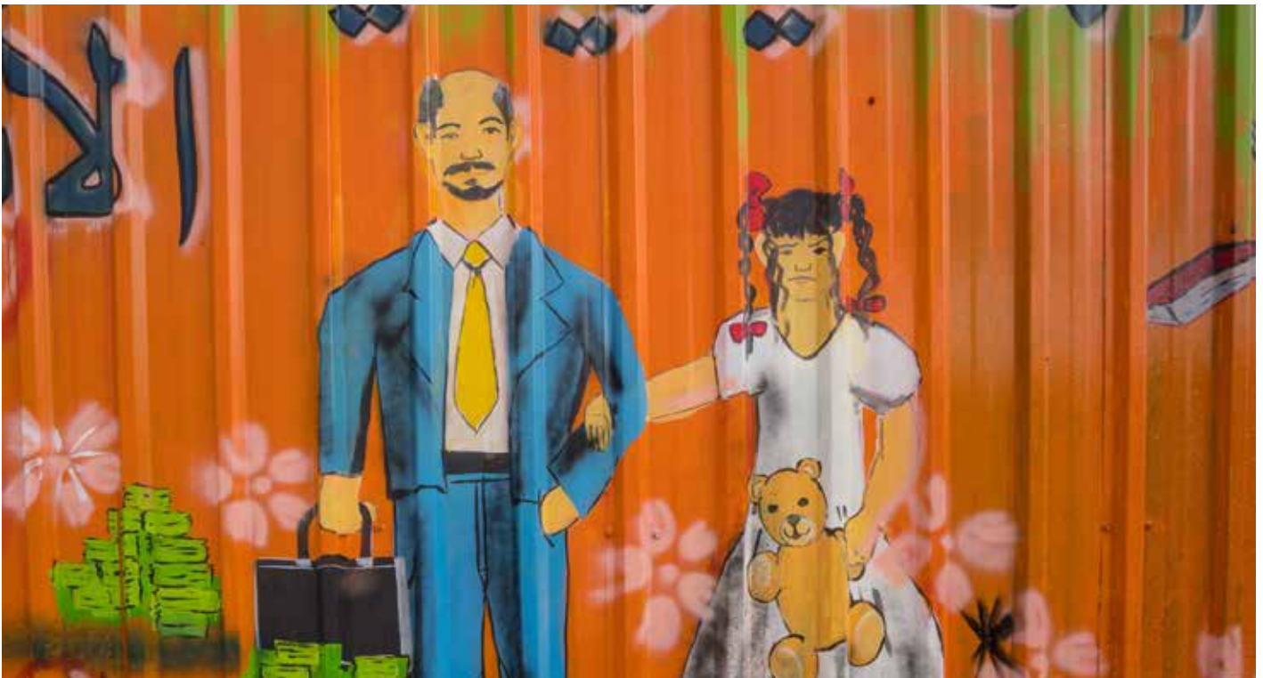
Image discouraging early-marriage in Zaatari camp.

Significant numbers of Syrian women – both single and married – have been propelled into paid-work endeavours, particularly in the urban city context. Whilst stressful and tough, this has often boosted women's confidence at the family level as they become primary economic agents. But this has also challenged gender relations, as men grapple with the new role reversal and power of women, and their own restricted reality. This newfound self-reliance and independence amongst many refugee women thus rests on fragile foundations, with cultural attitudes both within and outside the household hindering their work and safety.