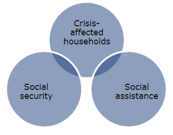
Figure 3 Difference between households affected by shock and those receiving social protection

It cannot be assumed that those benefiting from a social protection programme will also be those who need assistance following a covariate shock, either because of the geographical coverage of the programme in relation to the disaster-affected areas, or because those targeted for social protection are not most affected by the crisis (Bastagli, 2014; Humanitarian Futures Programme, 2014; Kuriakose et al. , 2012; La Rosa, 2015; McCord, 2013a, 2013b; Slater and Bhuvanendra, 2013; Slater et al. , 2015) (see Figure 3). The literature considering the merits of shock-responsive social protection highlights that coverage of the poor (especially those of working age) and/or those that are vulnerable to disasters generally remains low (Hallegatte et al. , 2016). There is therefore a risk that focusing on supporting existing social protection cohorts—the 'vertical expansion' in the OPM (2015a) framework described above—risks missing shock-affected households.