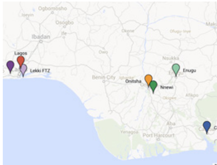
Figure 1: Site visits to Chinese industrial investments and technical partnerships

Initial fieldwork was conducted in July 2014 in Lagos, Ogun, and Calabar with twenty Chinese manufacturing firms, as well as four Nigerian firms with Chinese technical partnerships. Our research sites included the Chinese-built Ogun-Guangdong free trade zone (FTZ) (Ogun State) and the Lekki FTZ (Lagos State). We also spoke with current and former government officials and representatives from industry associations.