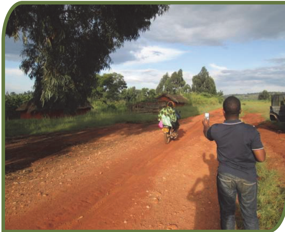
Picture 8: A Research Assistant taking a speed reading along the Ihimbo to Itimbo road

Two counts were carried out along the Ihimbo to Itimbo road: on 27 th and 28 th February, including a weekday, and a weekend day. There was no market day along this road during the study period.