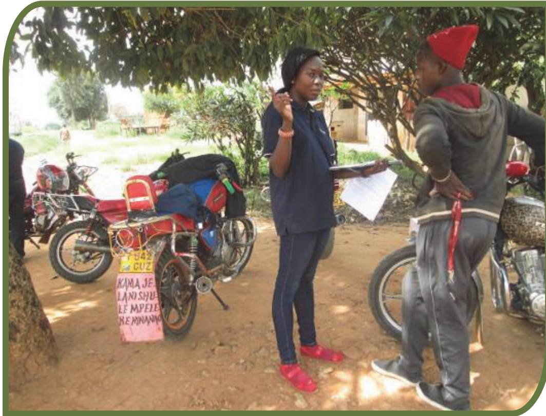
Picture 10: A Research Assistant carrying out a motorcycle interview

The table shows that the majority of interviews were carried out in the Boma la Ng'ombe to Mwatasi study area: 72 (58%) interviews were carried out here, while 53 (42%) were carried out in the Ihimbo to Itimbo study area.