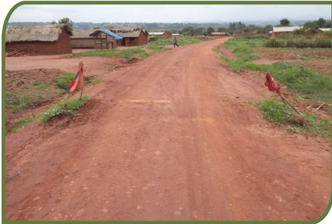
Picture 5: The road through Ihimbo village, with a locally-constructed speed hump

The Ihimbo village centre is made up of an estimated 100 to 150 houses. The road through the village centre is mainly used by pedestrians. The presence of locally-constructed speed humps on the road through the village indicates that local people consider road safety to be an issue.