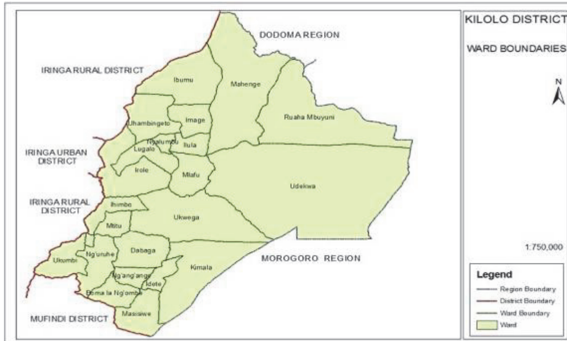
Figure 2: Locations of Boma la Ng'ombe and Ihimbo wards