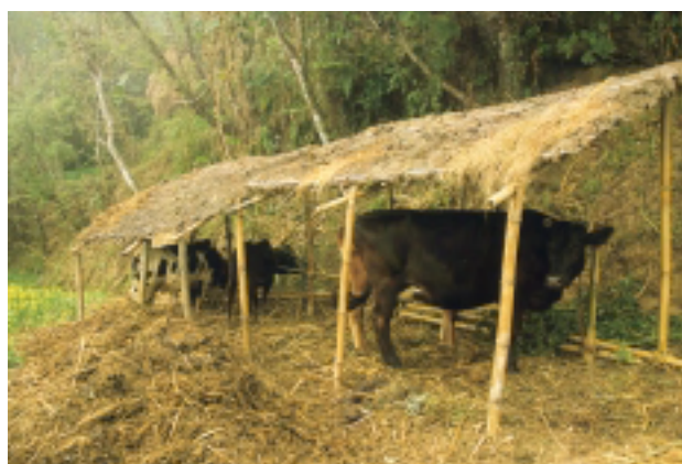
Stall-fed cattle, fed on a variety of local forages and stovers in fodder utilisation studies, in the middle hills of Eastern Nepal (near Pakhribas).