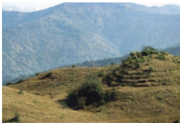
Typical terraced land used by crop/livestock farmers in Nepal.

Participating farmers were selected from four villages on the basis of key factors influencing feed supplies to livestock – season, site and ethnic group of the farmer. Data describing the utilisation of feed resources by buffalo, cattle, draught oxen and goats, collected on 29 crop/livestock farms during a 15-month monitoring study, showed that the relative extent of tree fodder utilisation during the dry season differed by more than 100 per cent across the