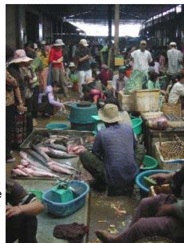
Markets and credit play an important role.

important role that the fisheries sector has in Cambodia in providing employment, income and food security to many of the country's poor and a safety net that can help many others. As such the CPHO specifically addresses poverty in the post-harvest sector and thus caters for a wider range of policy objectives and measures.