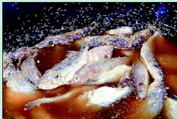
Plate 6c. Brine Infested With Blowfly Larvae