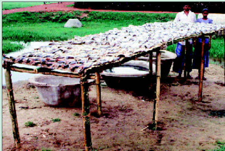
Plate 7c. Simple Drying Rack Made of Bamboo Poles and Rope