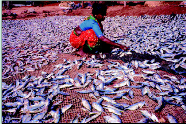
Plate 7a. Fish Being Dried on Coir Mat Placed on Ground