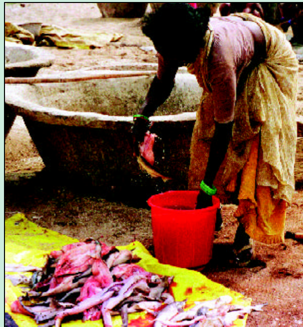
Plate 6b. Washing Fish After Gutting