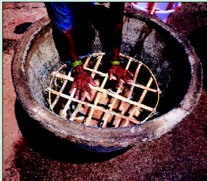
Plate 8c. Wooden Frame For Submerging Fish in Brine