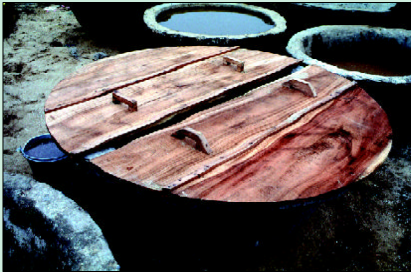
Plate 8b. Lid Constructed of Two Overlapping Halves