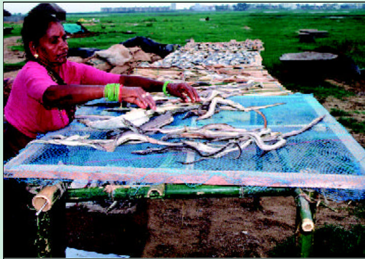
Plate 7b. Drying Tray Made of Old Fishing Net and Wood