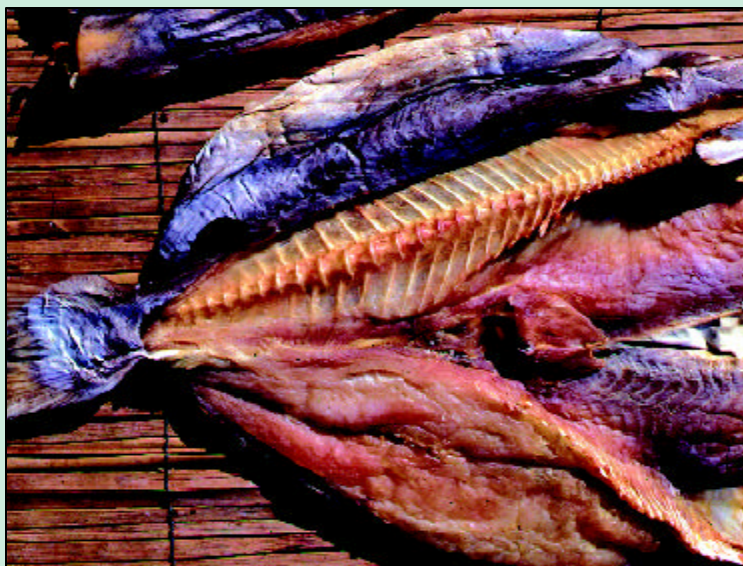
Plate 5c. Split Fish