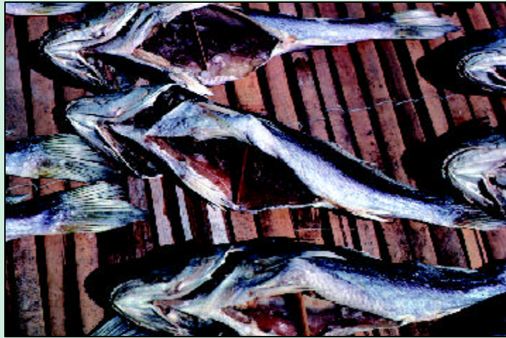
Plate 6a. Sticks Being Used to Hold Open Belly Cavities