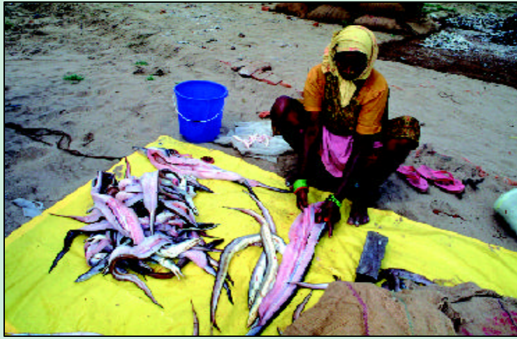
Plate 5a. Fish Being Gutted on Plastic Sheet