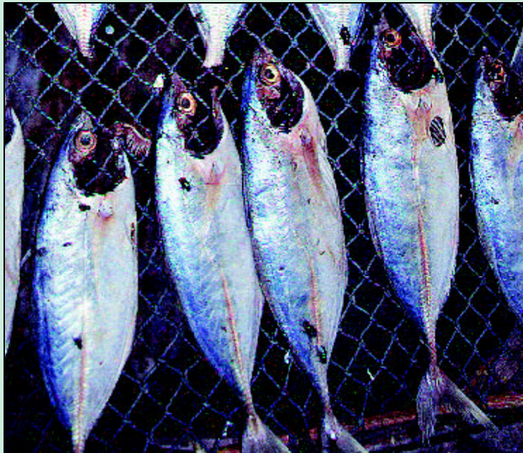
Plate 5b. De-gilled Fish