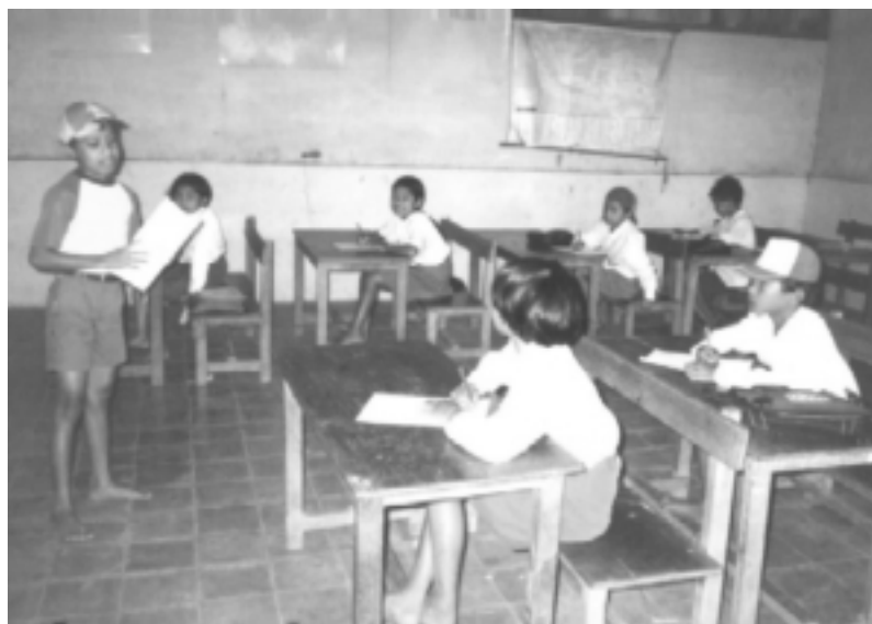
Photograph 5.1. When Teachers are Absent: Students Teaching Students

Since teacher distribution usually favors urban schools, teacher absence is more problematic in rural areas. There are enough, or even surplus, teachers in urban schools, so an absent teachers can easily be replaced. Such is not the case in rural areas. An absent teacher can force a class to continue without acceptable supervision or even discontinue a class. During the survey, SMERU researchers came across classes that were taught by senior students (Figure 5.1)