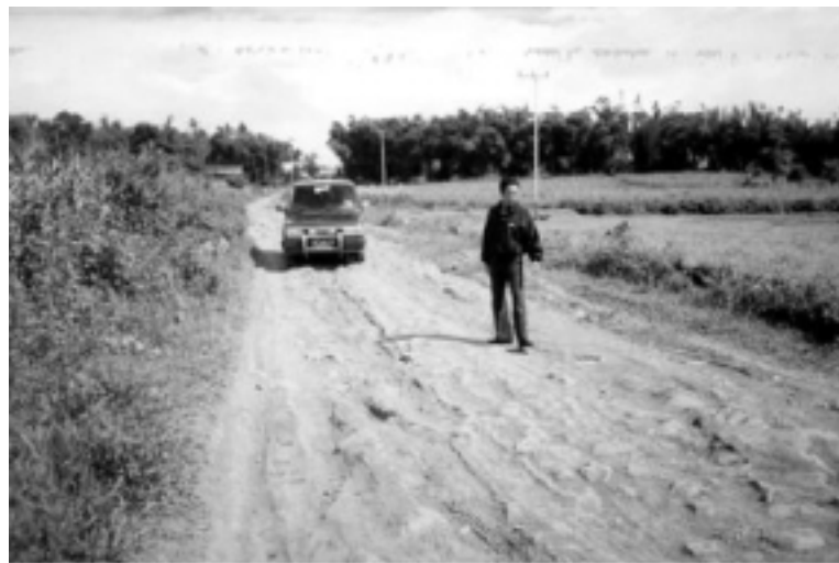
Photograph 4.1. The Road to School: During the Dry Season, These Roads are Difficult to Access, Let Alone during the Rainy Season.