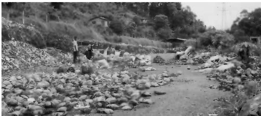
Photograph 2.1. Non-compostable coconut shells at a plant in Sri Lanka.

In low income countries the urban poor are extensively involved in waste recycling so their lack of interest in composting begs an important question: Why? Often the poor are aware of what composting is and remember family members doing it in the past, but they are unaware of the technology, process or potential markets for the product. Financially viable compost projects could benefit the poor by providing employment and additional income as well as a cleaner local environment and improved soils. Other reasons for lack of composting activity among the poor may be that they do not have the necessary capital to enable them to begin making compost (including to buy or rent land), but also that composting is often found to be unprofitable.