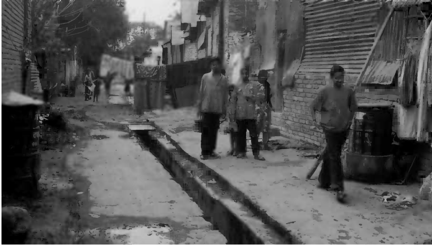
Photograph 6.1. Waste Concern barrel composting