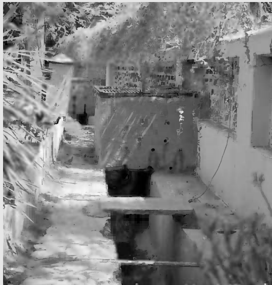
Photograph 3.3. Box system located at the Diamond Garden Residents Forum, treating the waste of 125 households. The compost produced is used for the greening of public places and as potting material. The bins are located above a drainage system at the former dumping area, which saves space. The neighbour appreciated the composting bins which replaced a smelly temporary dumping area.

The municipality provides a platform for exchange and communication among ALM representatives and municipal authorities. These meetings enable the residents to convey their area-related problems such as waste collection, road repair, lighting, water supply or drainage problems in front of the municipal authorities. Initially waste collection and street sweeping are often the priority focus of ALMs. Composting activities usually follow at a later stage. Out of 670 ALMs in Mumbai, 284 have incorporated box-composting activities. The municipal target is to have at least one composting site per ward. Even if composting is not on the list of priorities for ALMs it is important to recognize that the institutionally embedded structure of the ALM system sets the framework for such possible future activities.