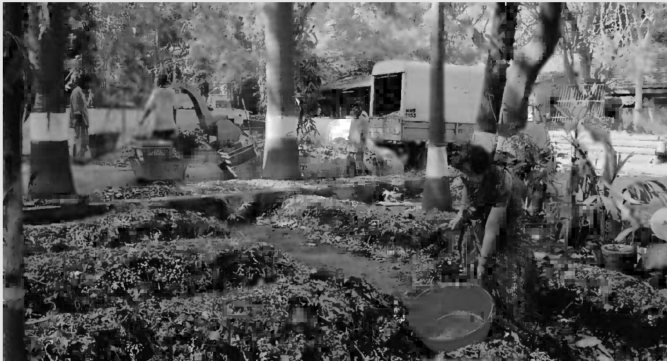
Photograph 3.4. Vermi-composting scheme at the Dadar Pumping Station, composting shredded market waste in small windrows

Vermigold is a vermi-composting company with five years' experience of providing mainly composting solutions to other organizations such as hotels, colleges, clubs and individuals, which are willing to compost their waste. Based on the premises of an old waste water treatment plant, they produce compost and worms in order to provide the material as starter and feedstock for new vermi-composting plants. They do not sell compost as fertilizer. The site is provided by the municipality at low rent. Vermigold does not get a collection fee for the market waste they collect for the scheme. The business is facing high risk as it is difficult to sell composting solutions regularly.