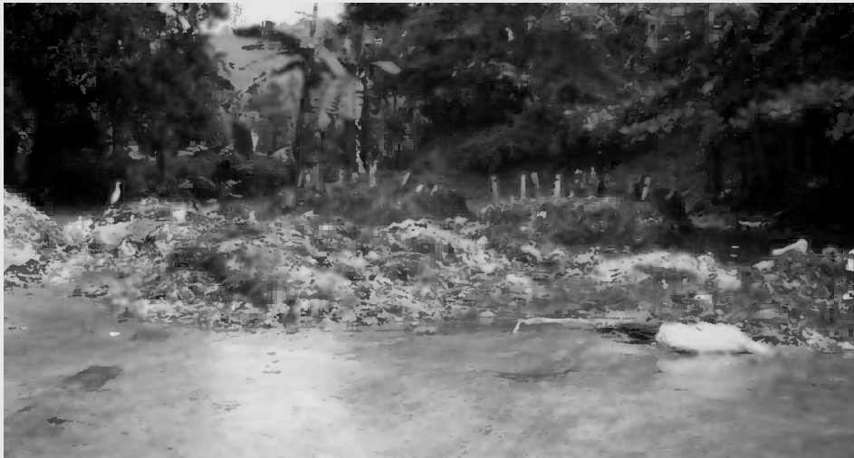
Photograph 5.1. Piles of waste and compost at the Ratnapura site.