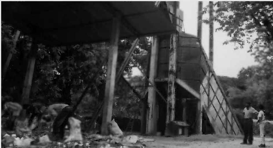
Photograph 5.2. The composting chute in Peradeniya, Kandy.

This project is a production-focused large-scale operation. The objective is effective and economically viable management of organic solid waste.