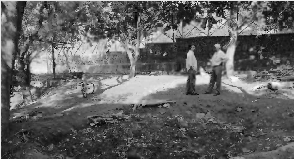
Photograph 3.5. Pit composting at TATA Power Residents Colony, one of the least cost solutions for composting. Such systems are only feasible if plenty of space is available and residents live at a considerable distance, as odours can result from the uncontrolled composting process.

This corporate housing colony has 520 flats in a spacious well-wooded campus. Earlier, contractors were hired to collect the waste and dump it in municipal bins. After an enquiry and proposal from a waste-pickers co-operative, the colony changed the contractor. This women's initiative provided a significantly better service than the former contractor, however their knowledge about composting was limited. They sort the waste, sell recyclables, and compost the organic fraction on shallow beds on the campus premises. The compost remains on the campus as it cannot be sold in the Mumbai market. The initiative provides jobs to 18 women and two supervisors. The residents do not directly pay the collection fees but a residents association pays about Rs50,000 per month coming from rental fees. The shortfall of Rs15,000 is paid by a grant from the TATA Power Company.