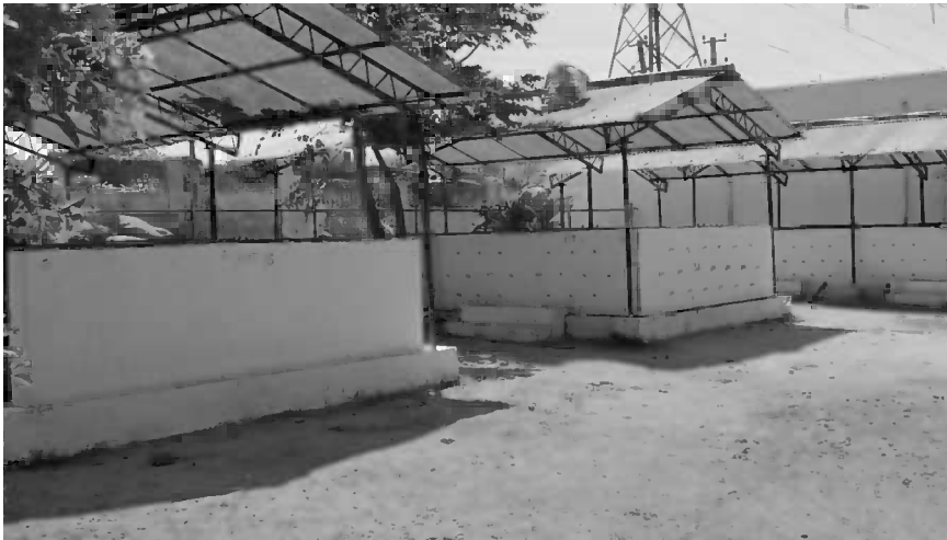
Photograph 3.2. Composting bins at Kalyana Nagar Residents Association, Bangalore. The area is kept clean in order to avoid complaints from the neighbourhood. The compost is mainly sold to residents but also used for public gardens in the area.

The needs and priorities of the residents themselves set the framework of the scheme. Revenues by fee collection - a very tedious and time-consuming task, mostly conducted by voluntary members - often guarantees the financial viability of the scheme.