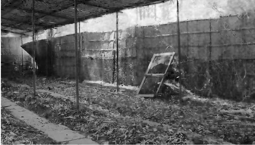
Photograph 3.1. Shallow windrow composting at Sindh Colony, Pune. The scheme is very well protected from sight of residents and the roof protects the compost from being soaked during the rainy season. The compost is sold at Rs6/kg to residents and neighbouring colonies.

This case study summarizes different approaches of decentralized composting schemes in the cities of Bangalore, Chennai, Pune and Mumbai. It provides information on their technical, operational, organizational, financial and social set-ups. For this case study the decentralized organizations include neighbourhood and community initiatives (by community-based organizations), company and institution initiatives for internal waste management, and private enterprises. Lessons learned from these composting experiences are briefly summarized below, but have also been documented and distributed to the Urban Local Bodies in India.